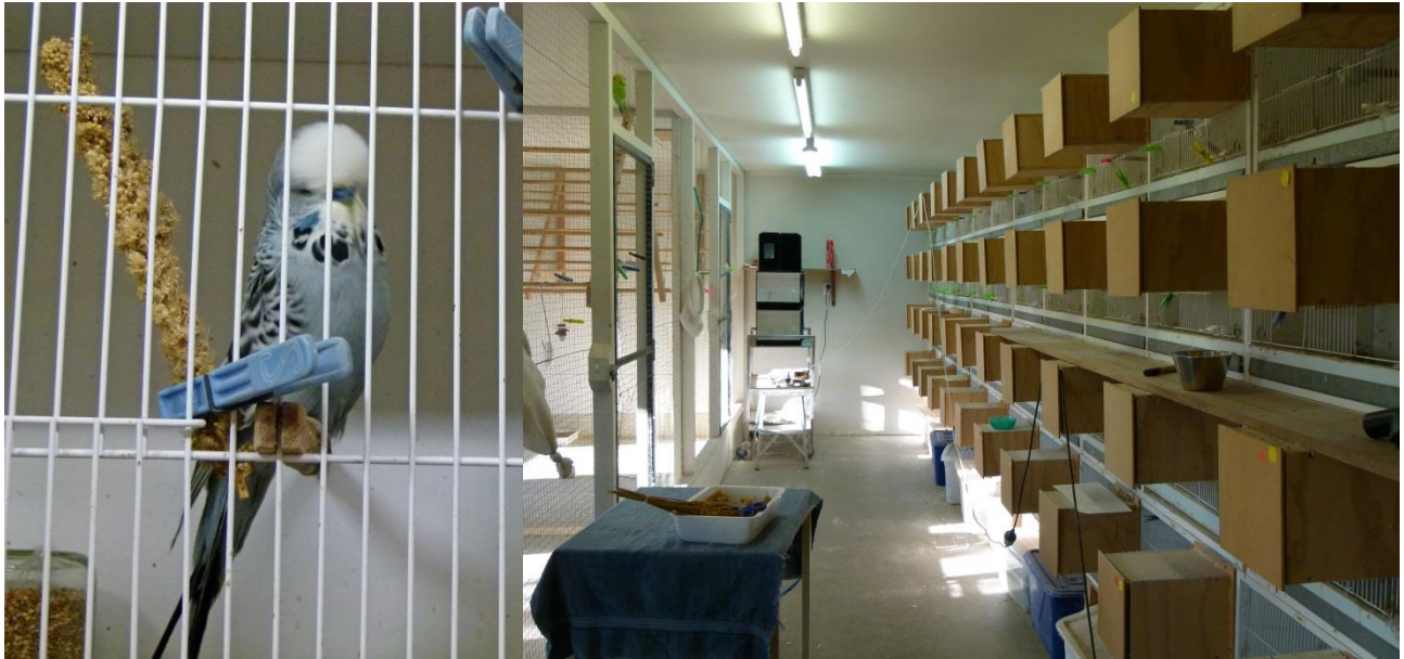
Father of the two below