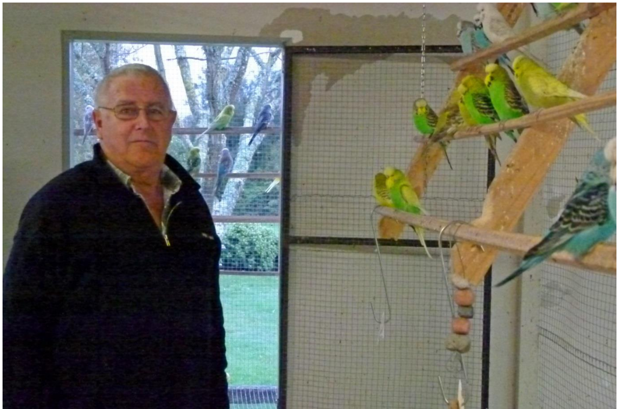
Note the wire hooks hanging on the perches they have dog biscuits, cuttlebones and mineral blocks threaded on them.