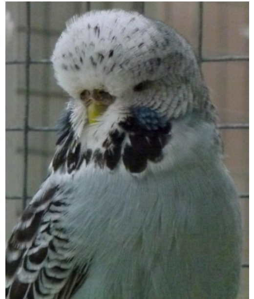
A look at the Ingoe birds