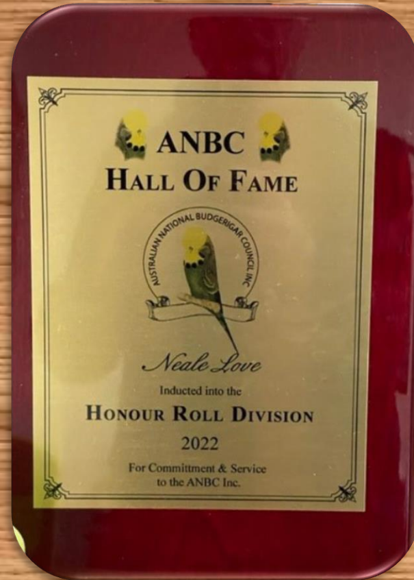
HONOUR ROLL FOR SERVICES ANBC