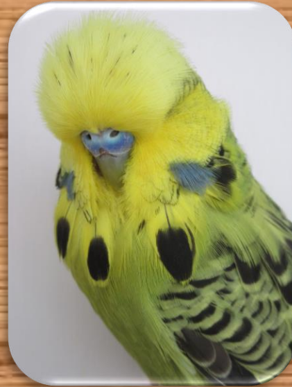
Kakoschke & Rise SA