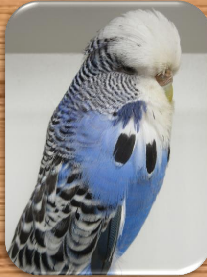
A Jaeschke WA