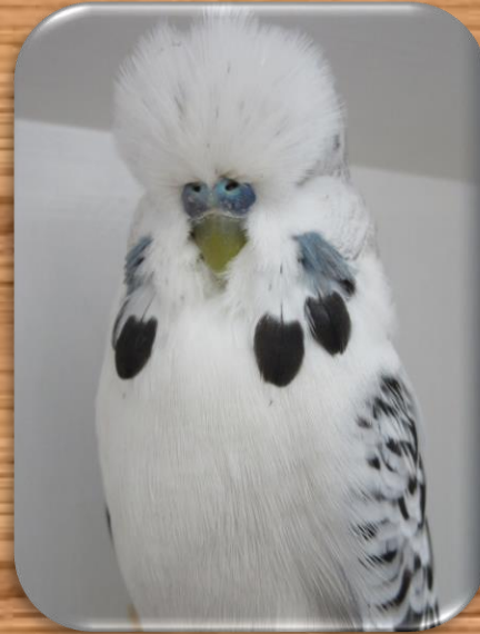
B Bathols WA