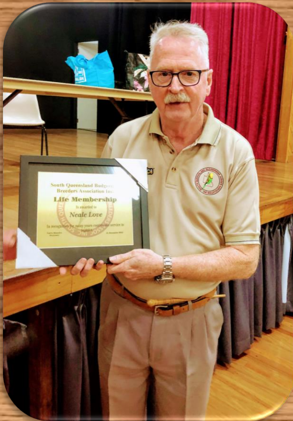
LIFE MEMBERSHIP SQBBA