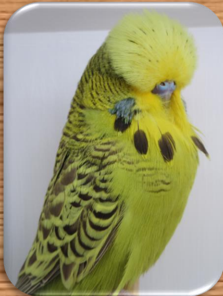
O'Callaghan Family N&CQ