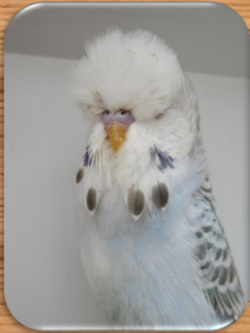
N Wheatley WA