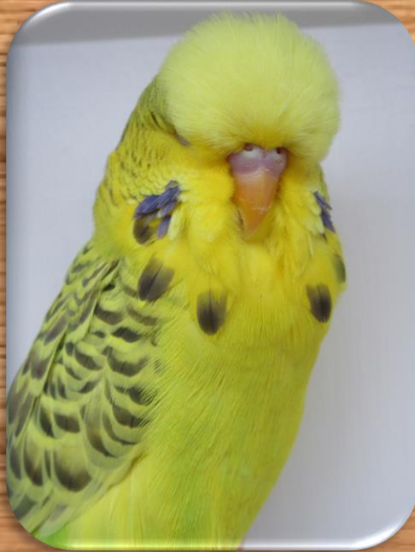
R & C Ogden N&CQ