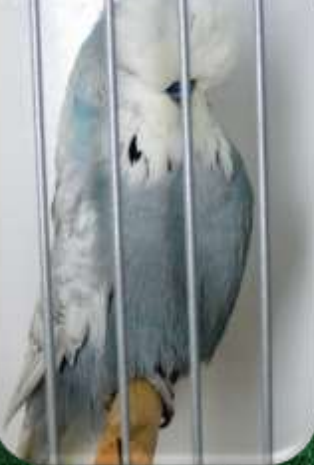
2011 Winner B & M Boal SQ