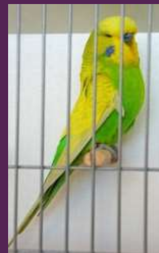
2010 Winner Kakoschke & Rice SA