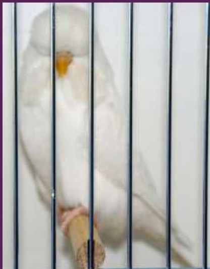
2007 Winner Marshall Family S.A