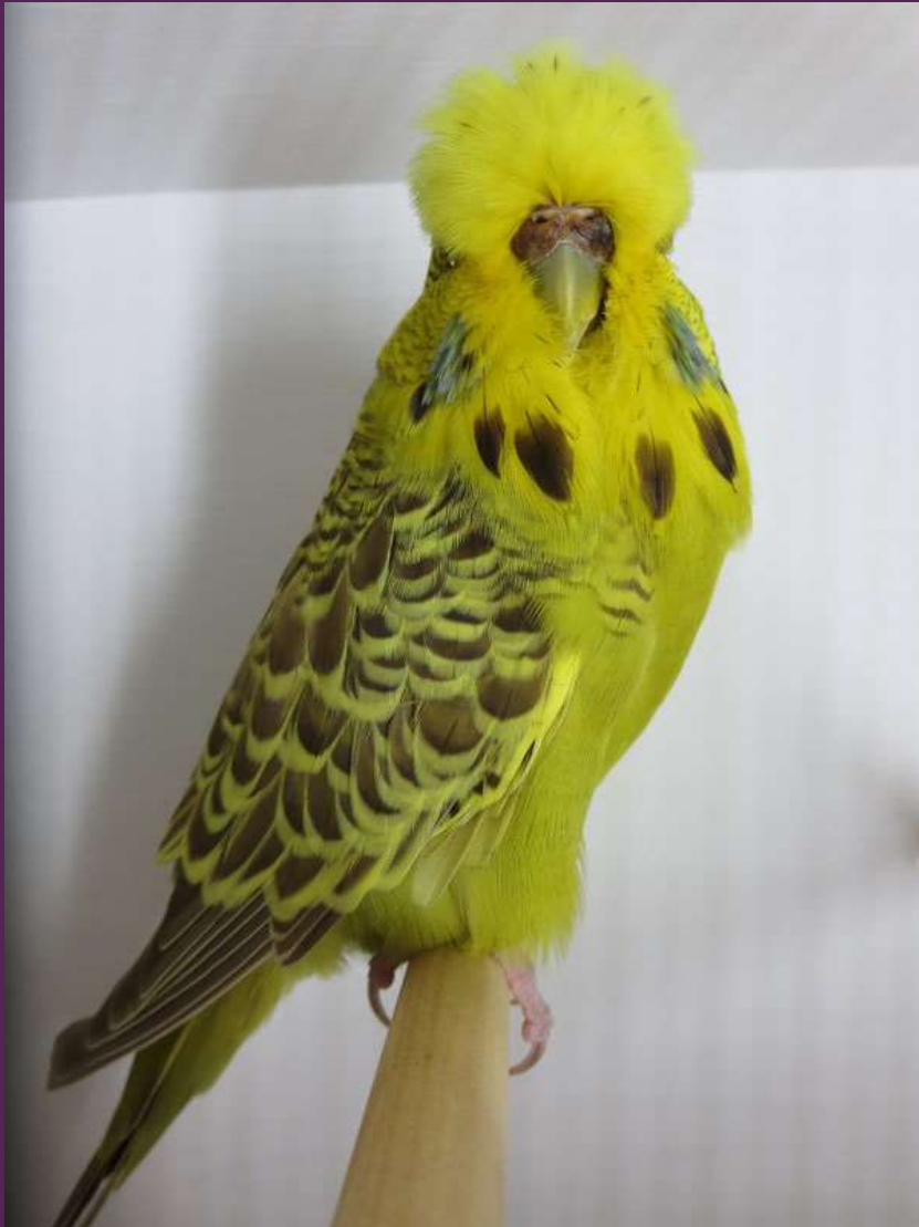
Henry George SQ