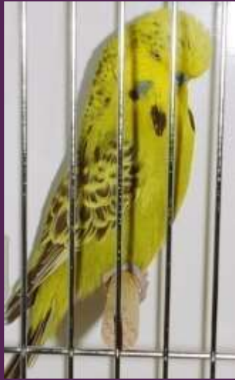
2007 Winner M & R Fellows NSW