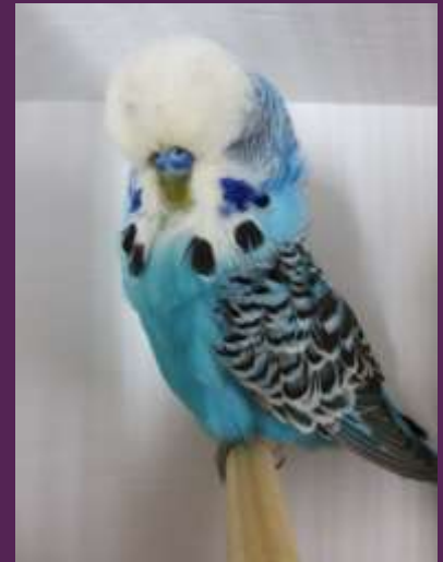
2014 Winner M Pace QN&NZ