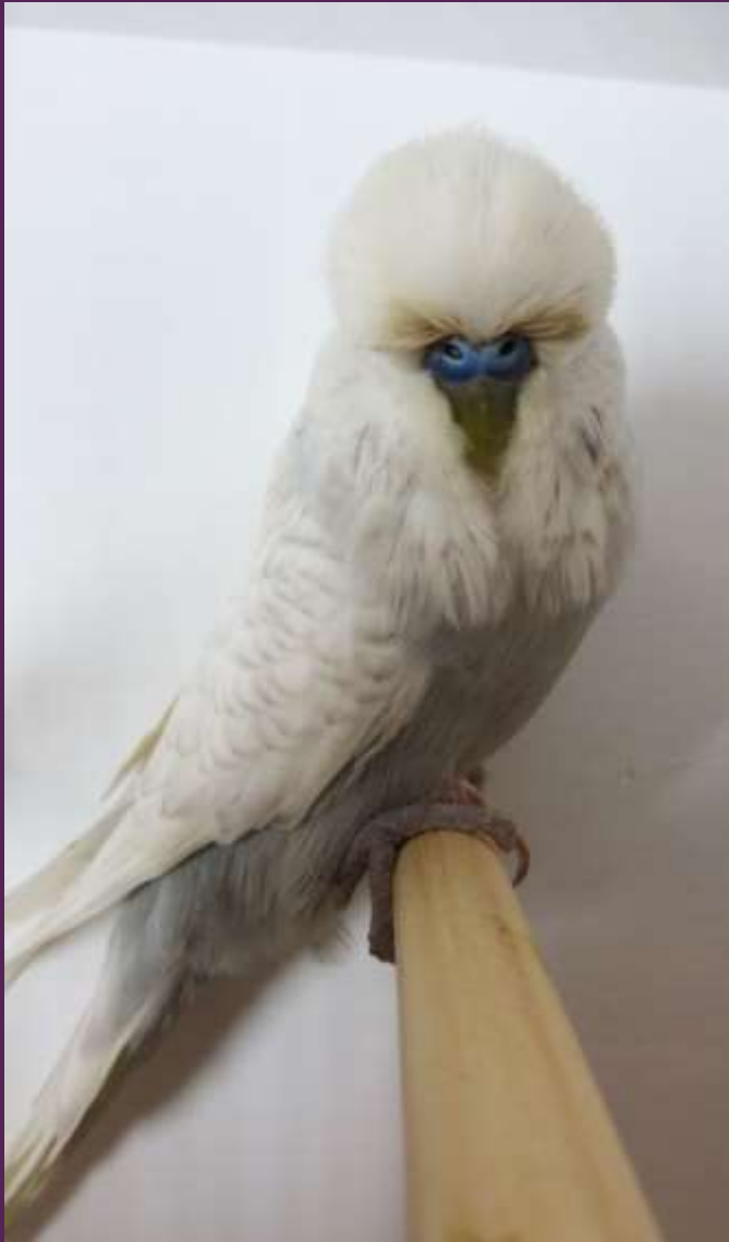
A Brown VIC