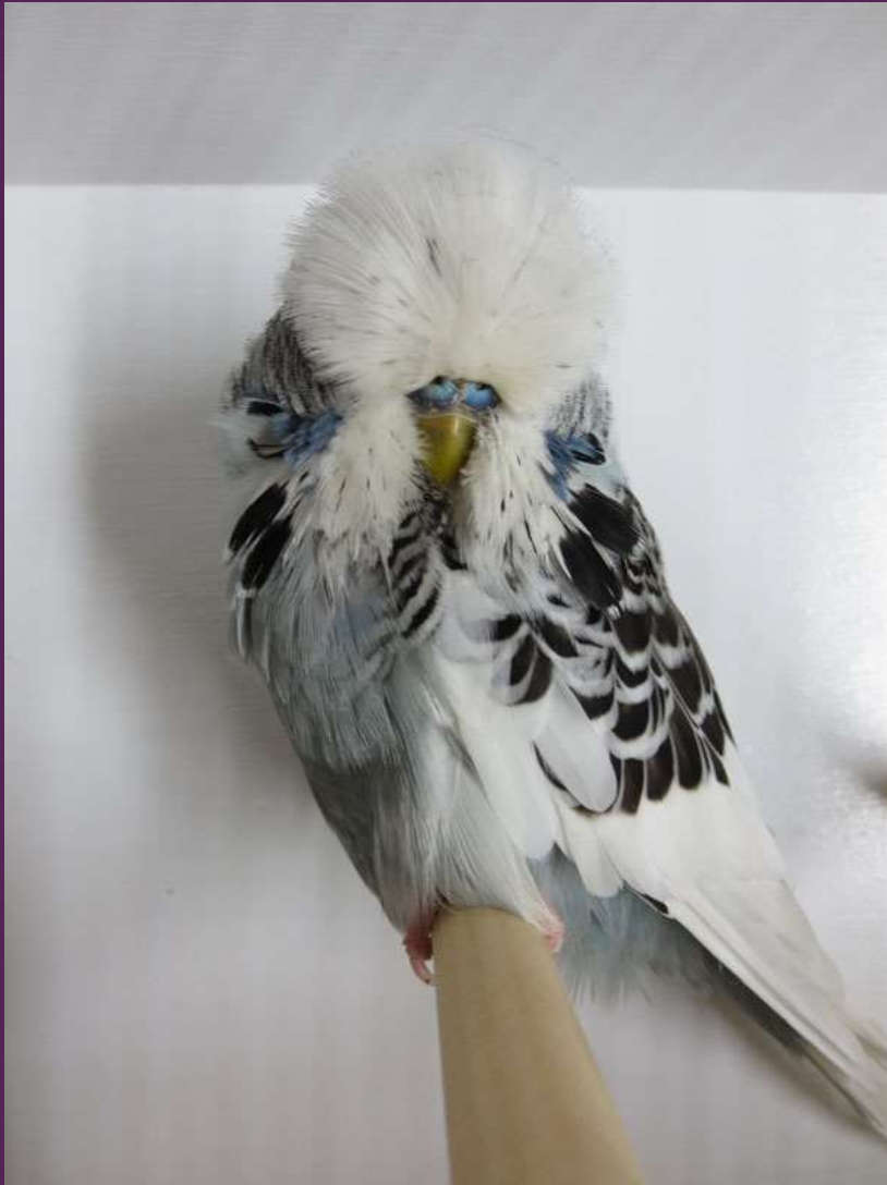
Kakoschke & Rice SA