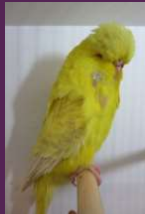
Lacewing Wally Capper