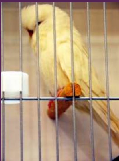
2011 Winner C & B Gearing WA