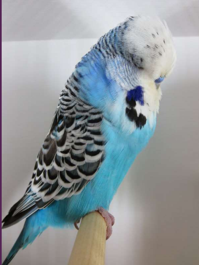
Henry George SQ