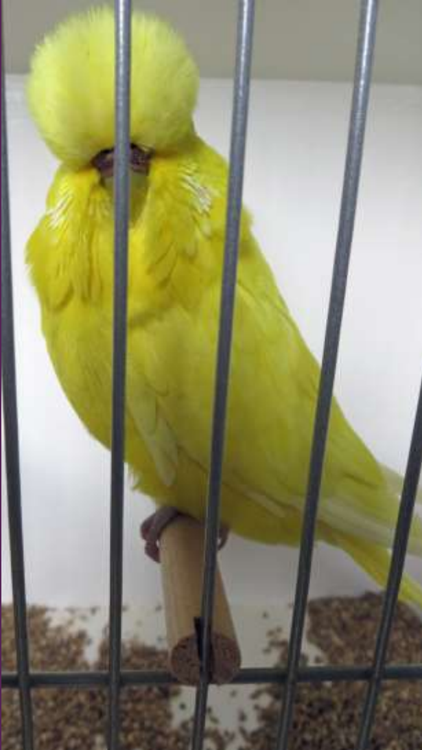
2013 Winner Norm Wheatley WA