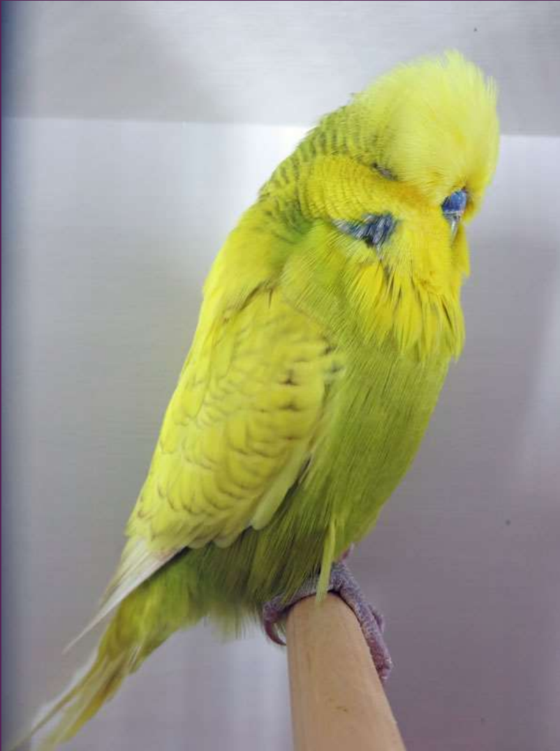
Kakoschke & Rice SA