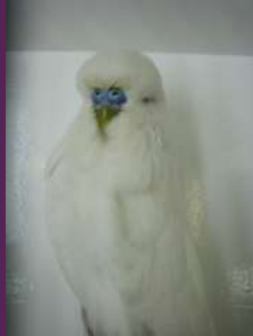
2009 Winner Charlton & Melbourne Vic