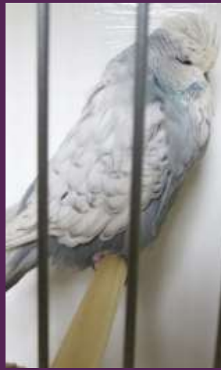
2013 Winner Alan Kent South Qld