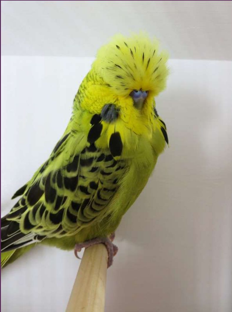
Henry George SQ