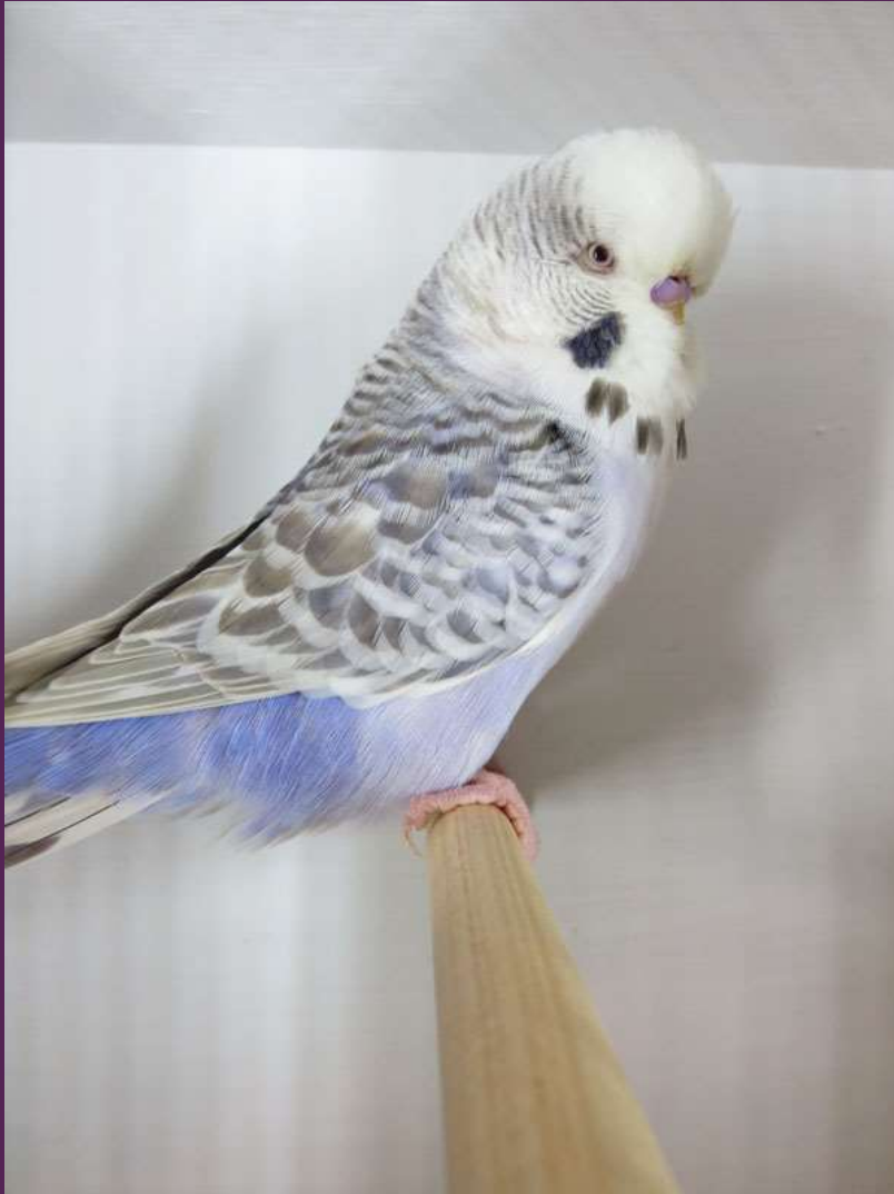
Kakoschke & Rice SA