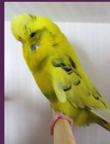
2014 Winner Marshall Family SA