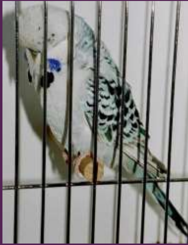
2007 Winner Church & O'Reilly SQ