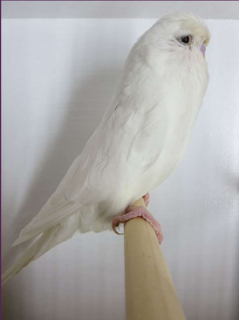
Mort Faddy SQ