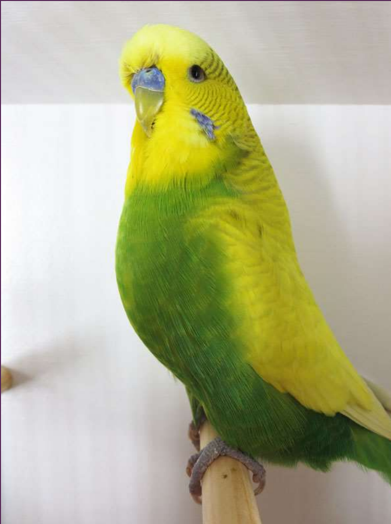
Blair & Poole TAS