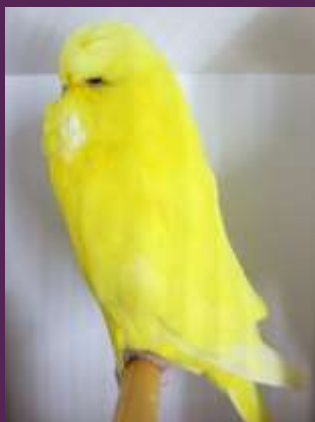
Spangle D/F Craig Sutherland