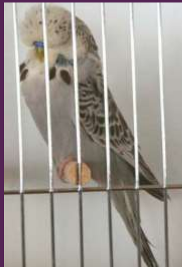
2008 Winner C & M Ault South Qld