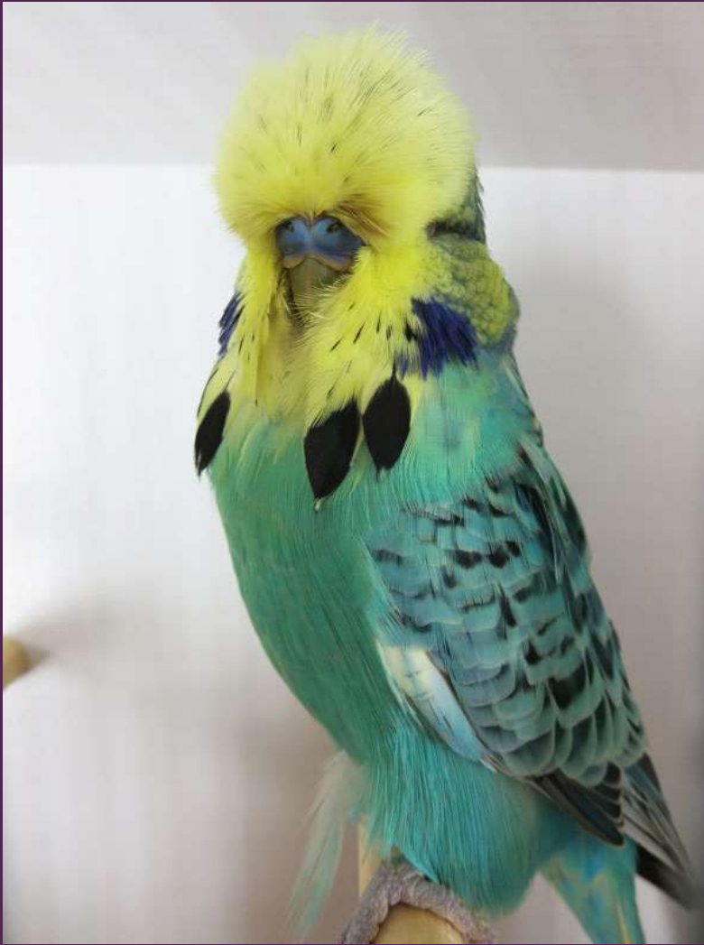
Sheppard & Flanagan VIC