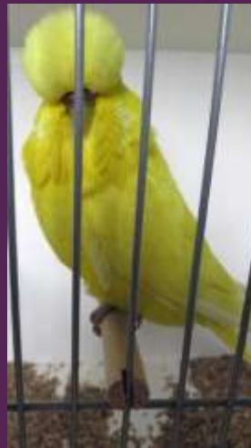
2013 Winner Norm Wheatley WA