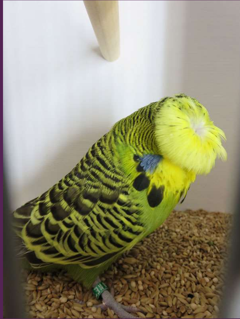
2014 Winner D & R Lange SA