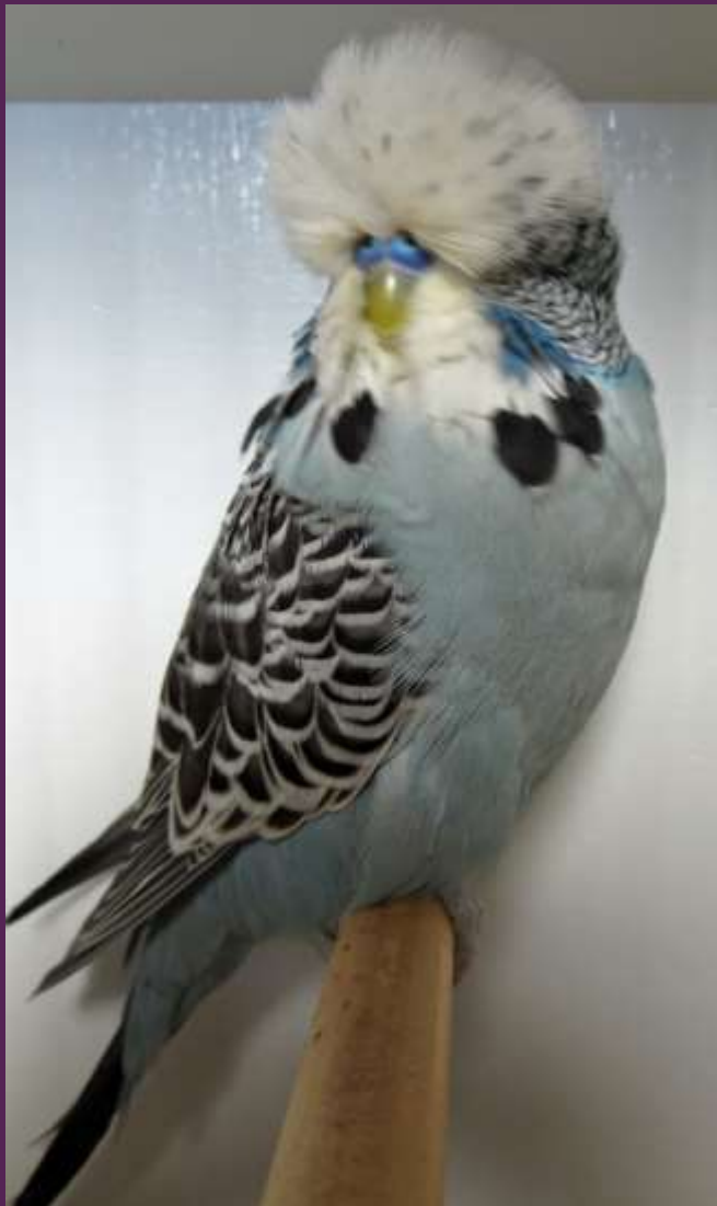
2013 Winner C & B Gearing WA