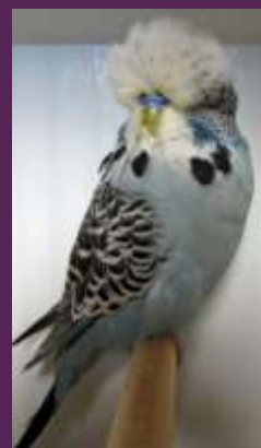
2013 Winner C&B Gearing WA