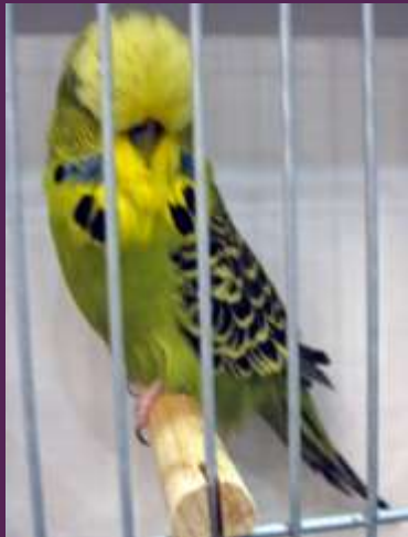
2011 Winner Welshman Family NSW