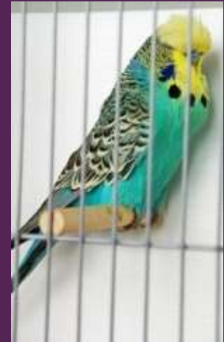
2010 Winner Wood & Drew VIC