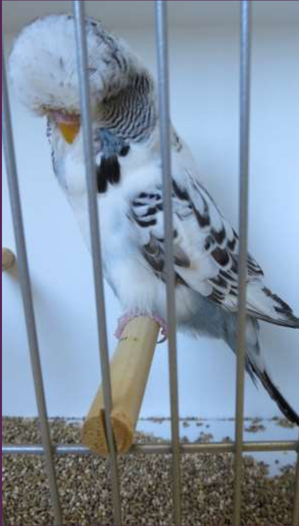
2013 Winner Norm Wheatley WA