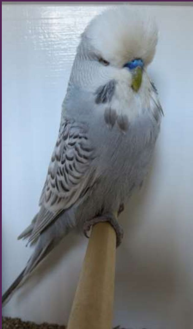
2013 Winner Wally Capper NSW