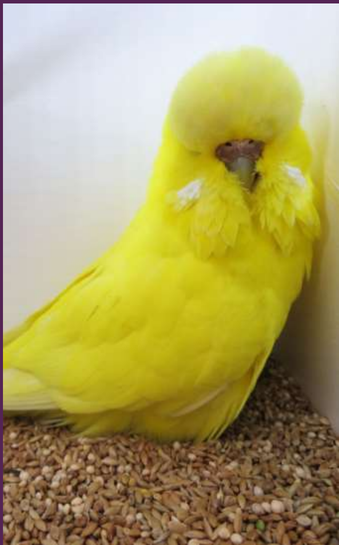
Henry George SQ