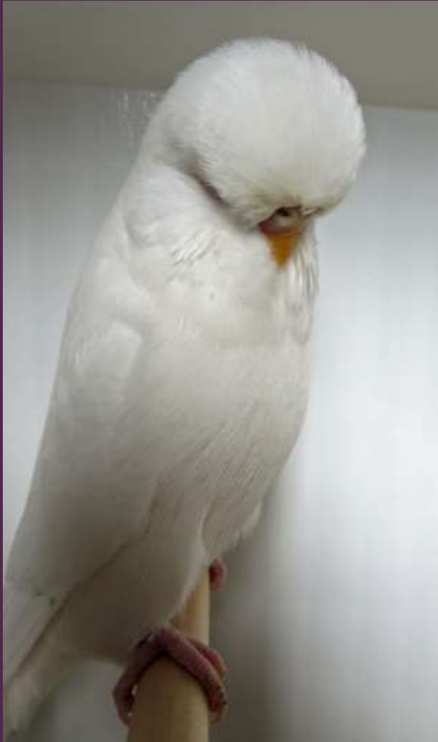
2013 Winner Podger & Ritchie VIC