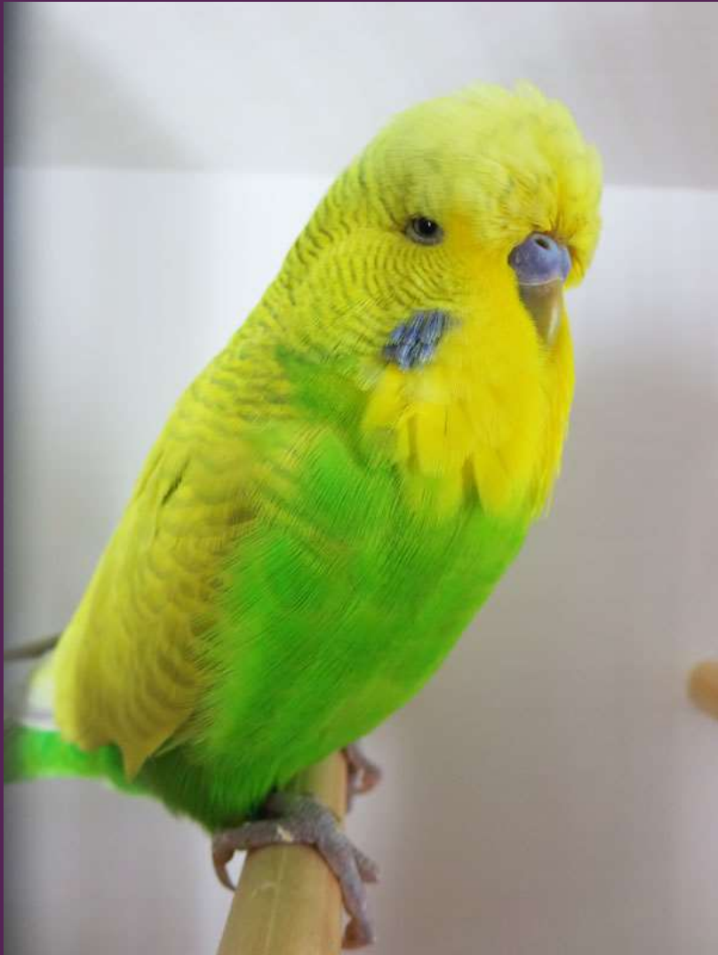
Kakoschke & Rice SA