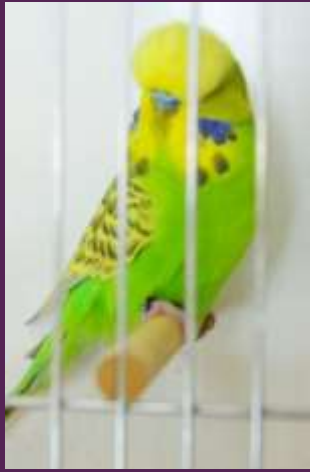
2009 Winner Wally Capper NSW