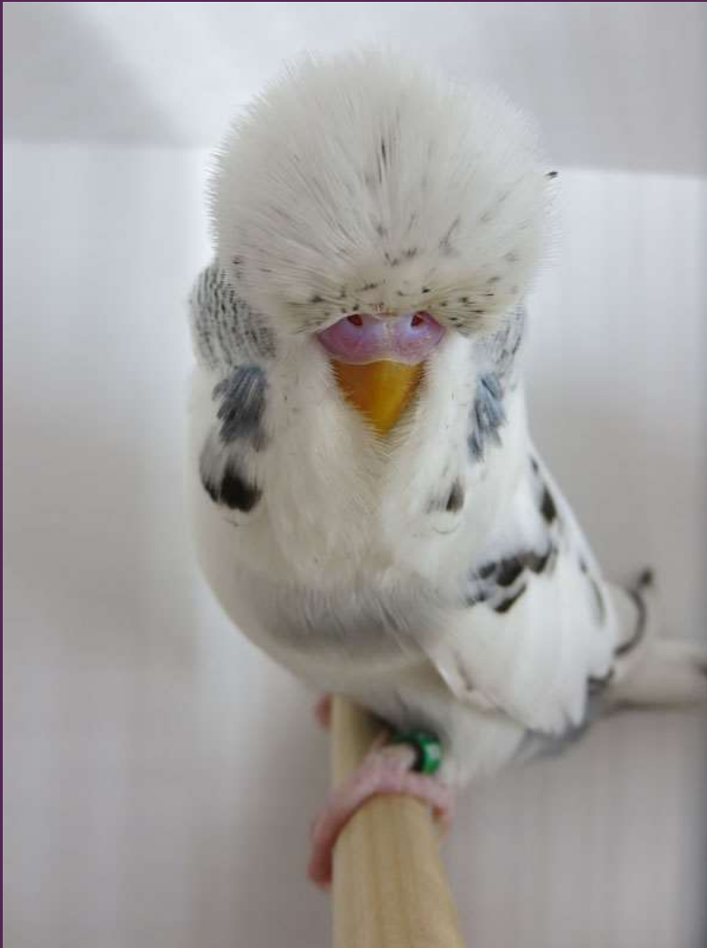
Norm Wheatley WA