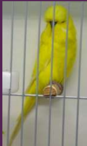
2012 Winner Blair & Poole TAS