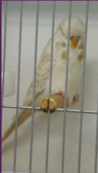
2012 Winner Wright Family SQ