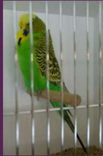
2009 Winner D&R Lange SA