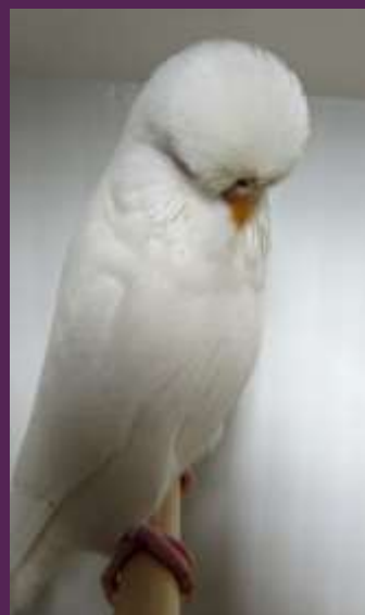
2013 Winner Podger & Ritchie VIC