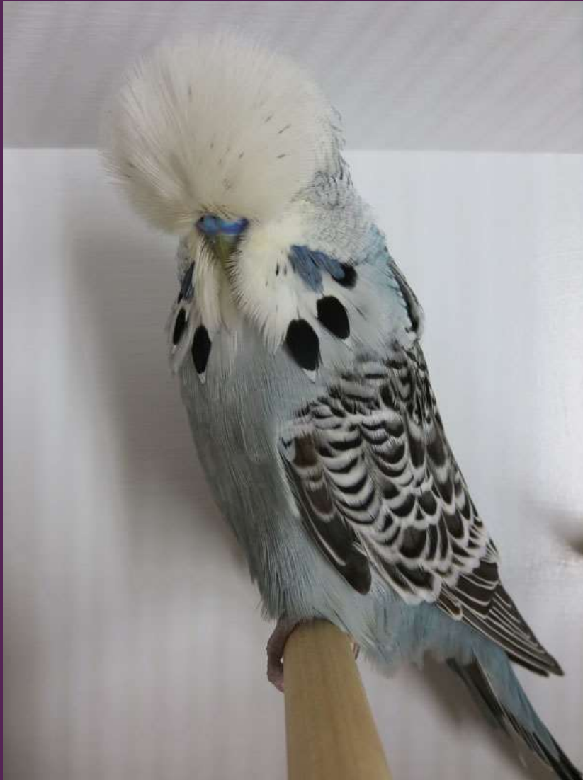
Henry George SQ