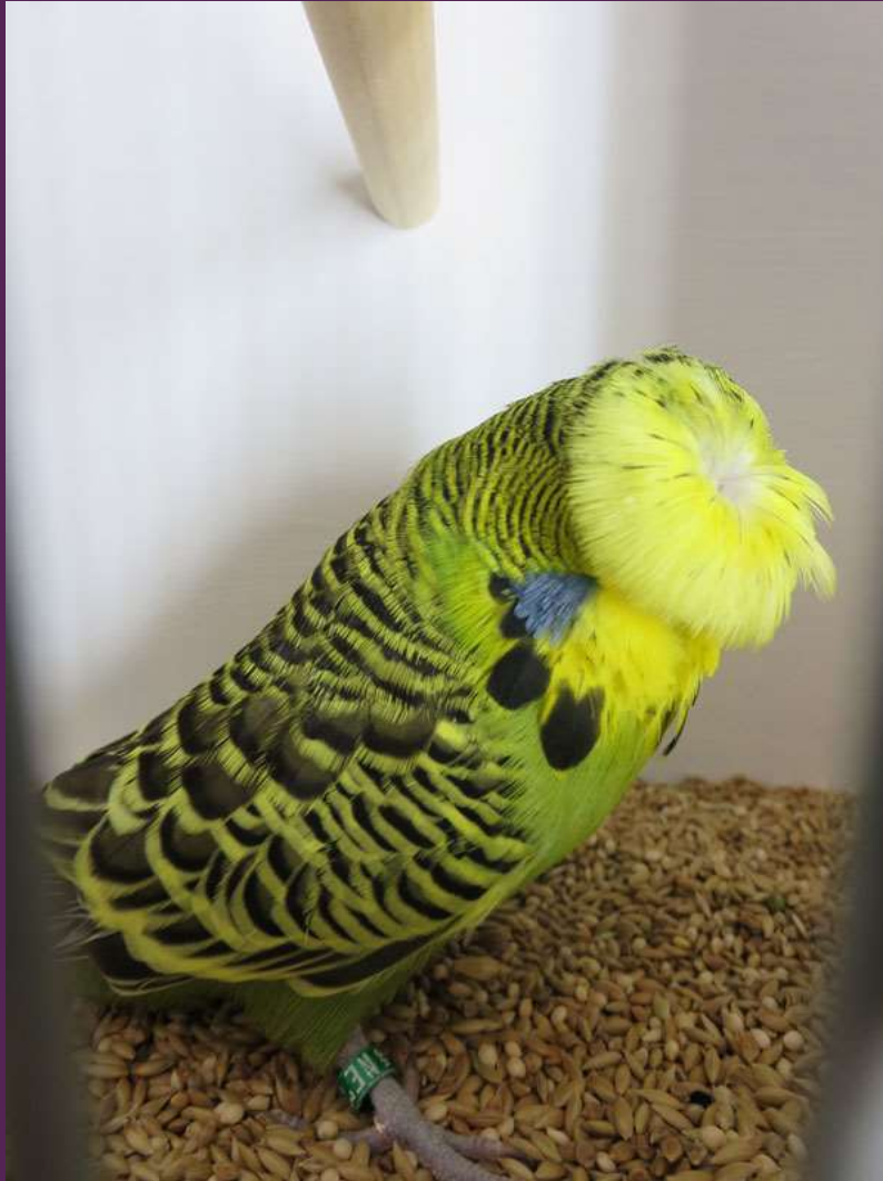
D & R Lange SA