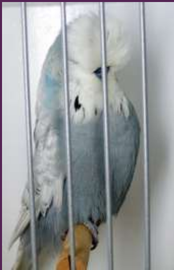
2011 Winner B & M Boal SQ