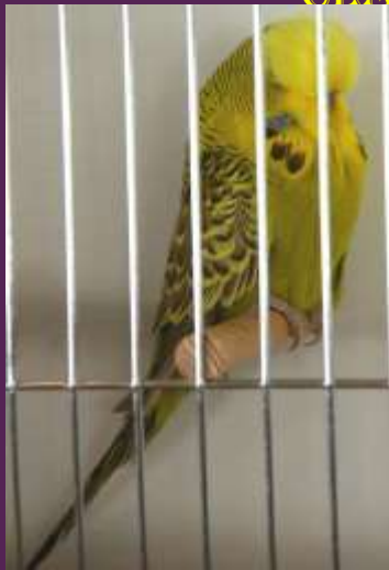
2008 Winner Welshman Family NSW