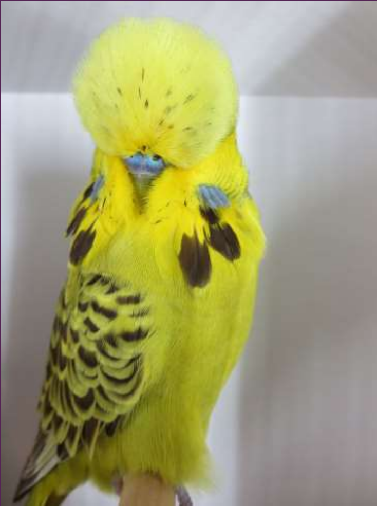
Kakoschke & Rice SA