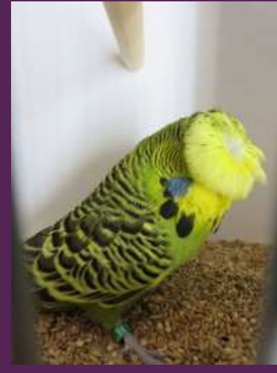
2014 Winner D & R Lange SA