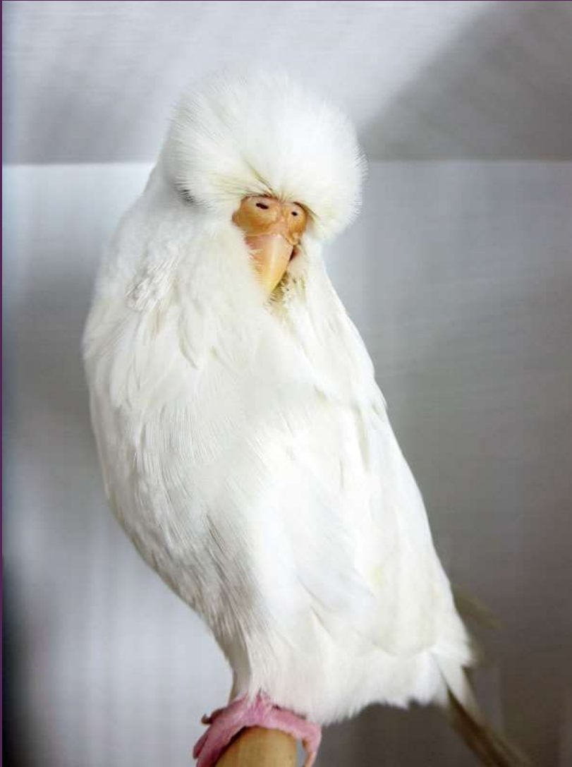
B Mellington VIC