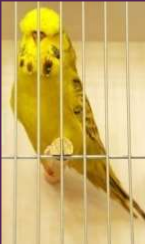
2011 Winner C & B Gearing WA