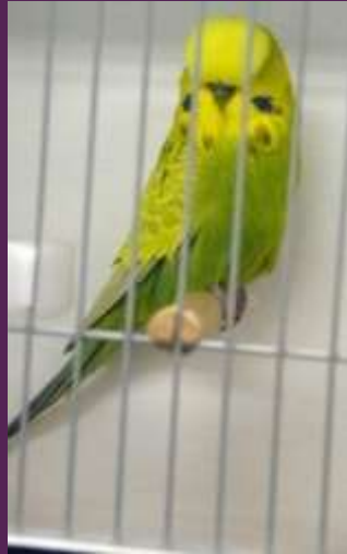
2012 Winner Howard & Home TAS