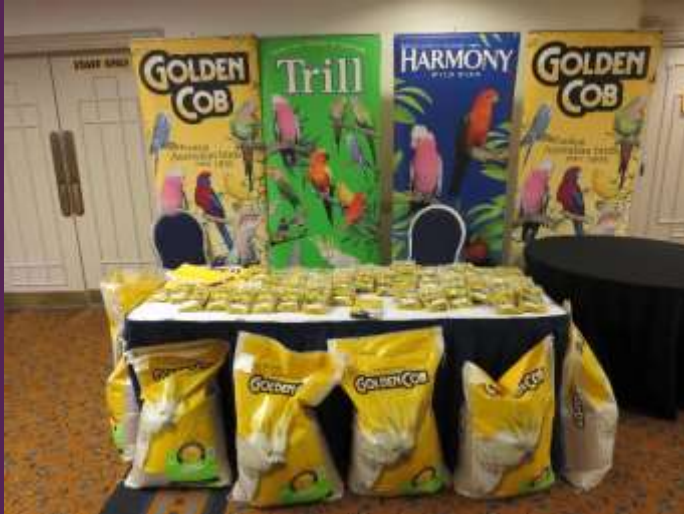
GOLDEN COB SPONSORS