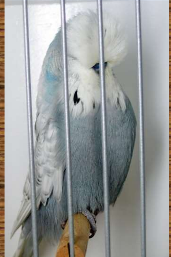
B & M Boal WRBS