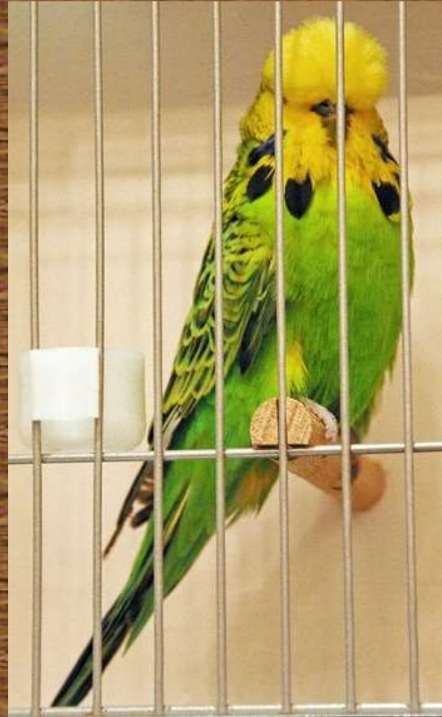
2011 Winner Kakoschke & Rice SA