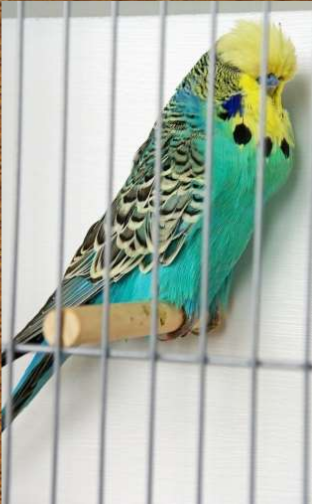
2010 Winner Wood & Drew Vic