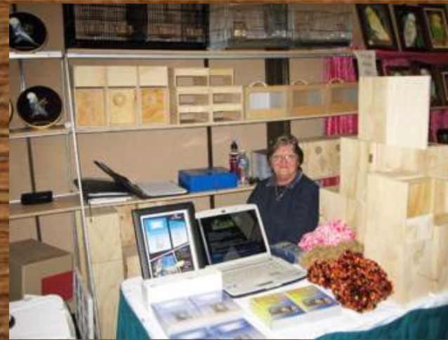
Bird Boxes Galore