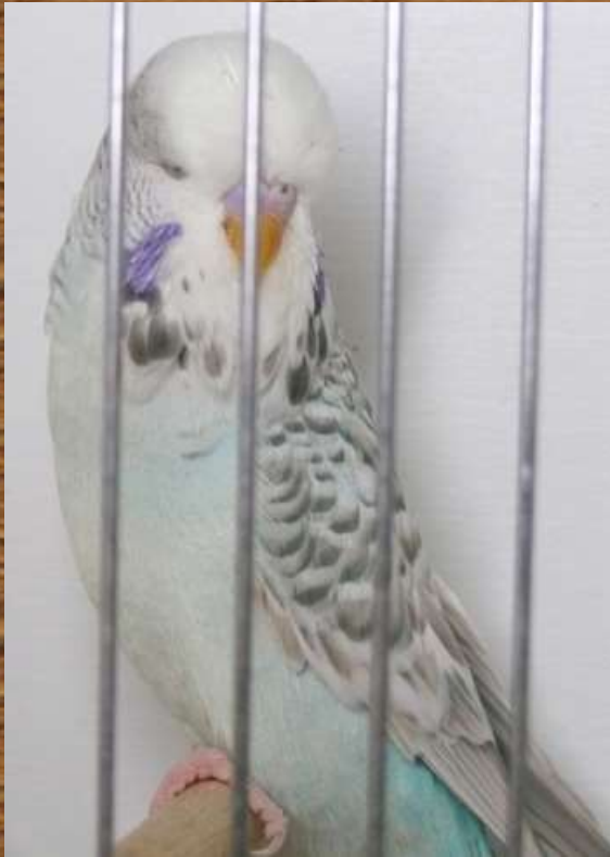
Whell Family WRBS