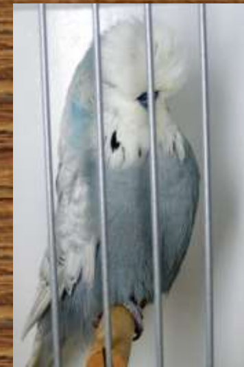
2011 Winner B & M Boal SQ