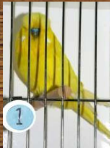
2006 Winner Dodgey Brothers West Aust