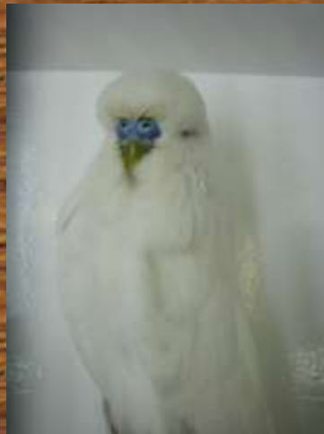
2009 Winner Charlton & Melbourne Vic