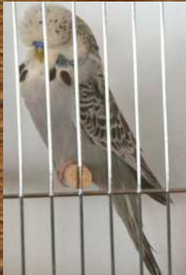
2008 Winner C & M Ault South Qld