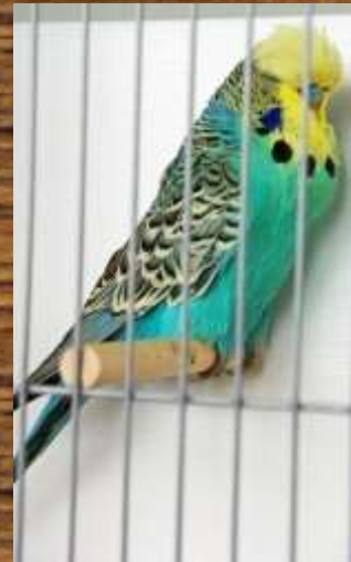
2010 Winner Wood & Drew VIC