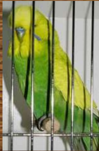
2005 Winner Kakoschke & Rice SA