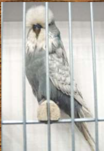
Spangle B & M Boal WRBS