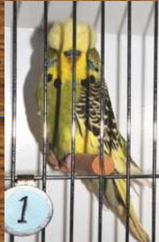
2006 Winner Blair & Poole Tasmania