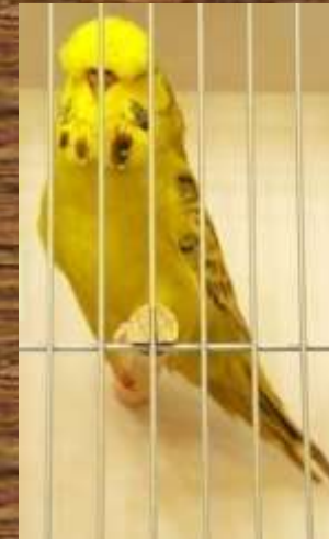
2011 Winner C & B Gearing WA