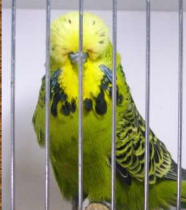
DAVE FRAMPTON (IBS)