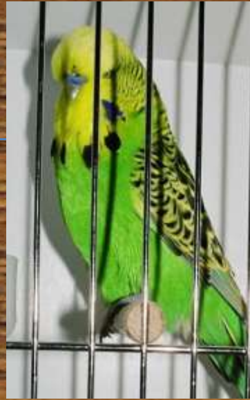
2005 Winner Kakoschke & Rice SA