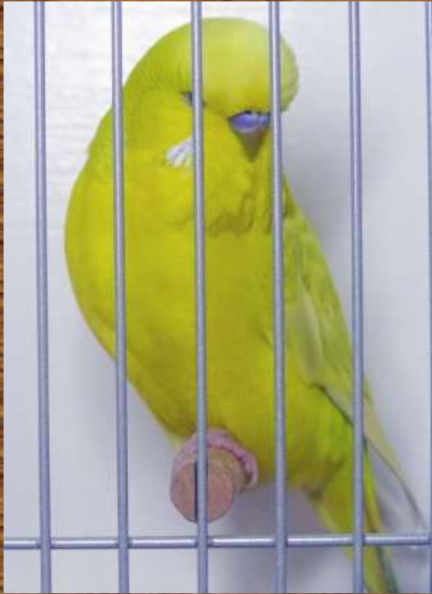
P Schellbach BNSBS