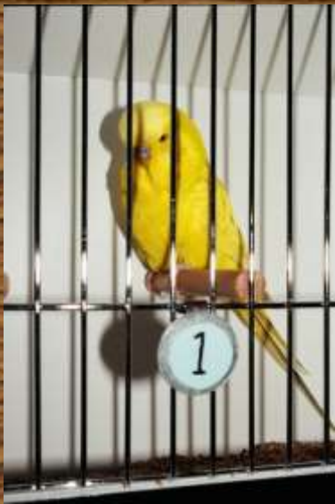
2004 Winner H Wood NSW