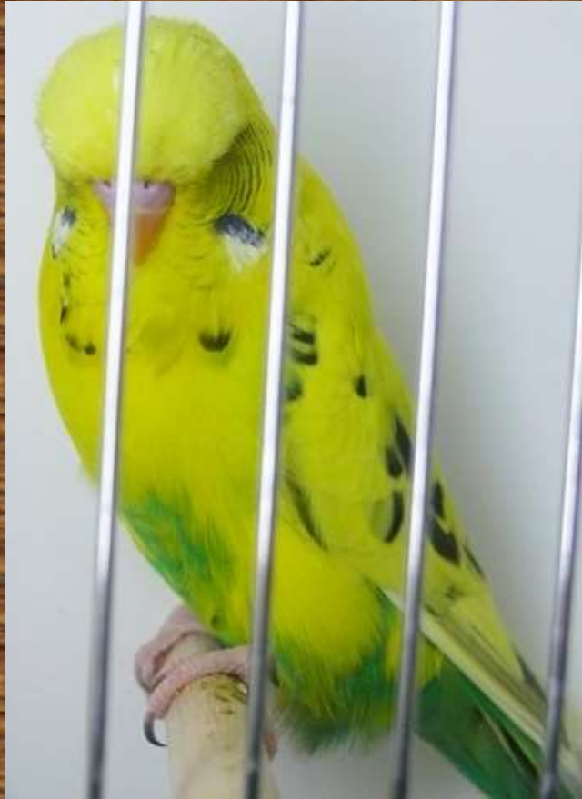
Henry George BNSBS