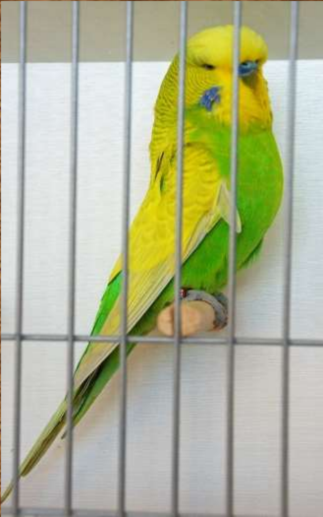
2010 Winner Kakoschke & Rice SA