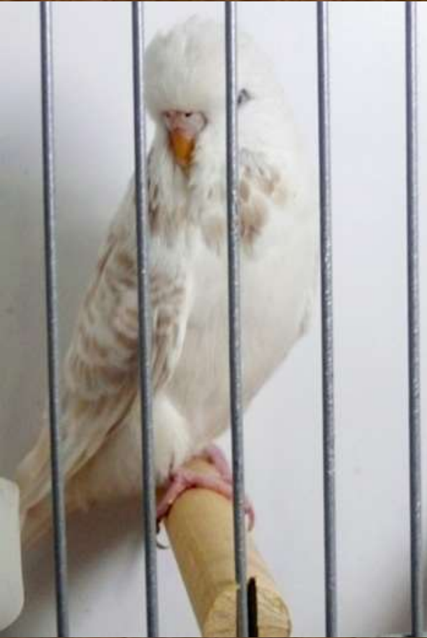
Cosh Family SPBS