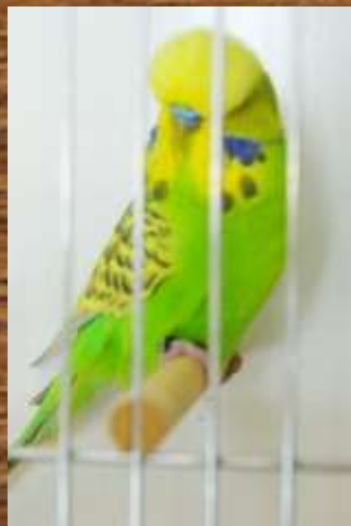
2009 Winner Wally Capper NSW