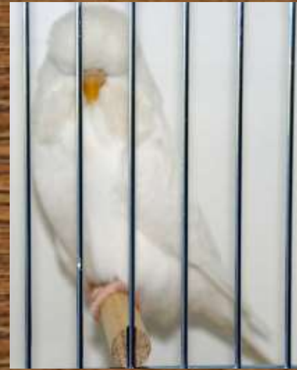
2007 Winner Marshall Family S.A