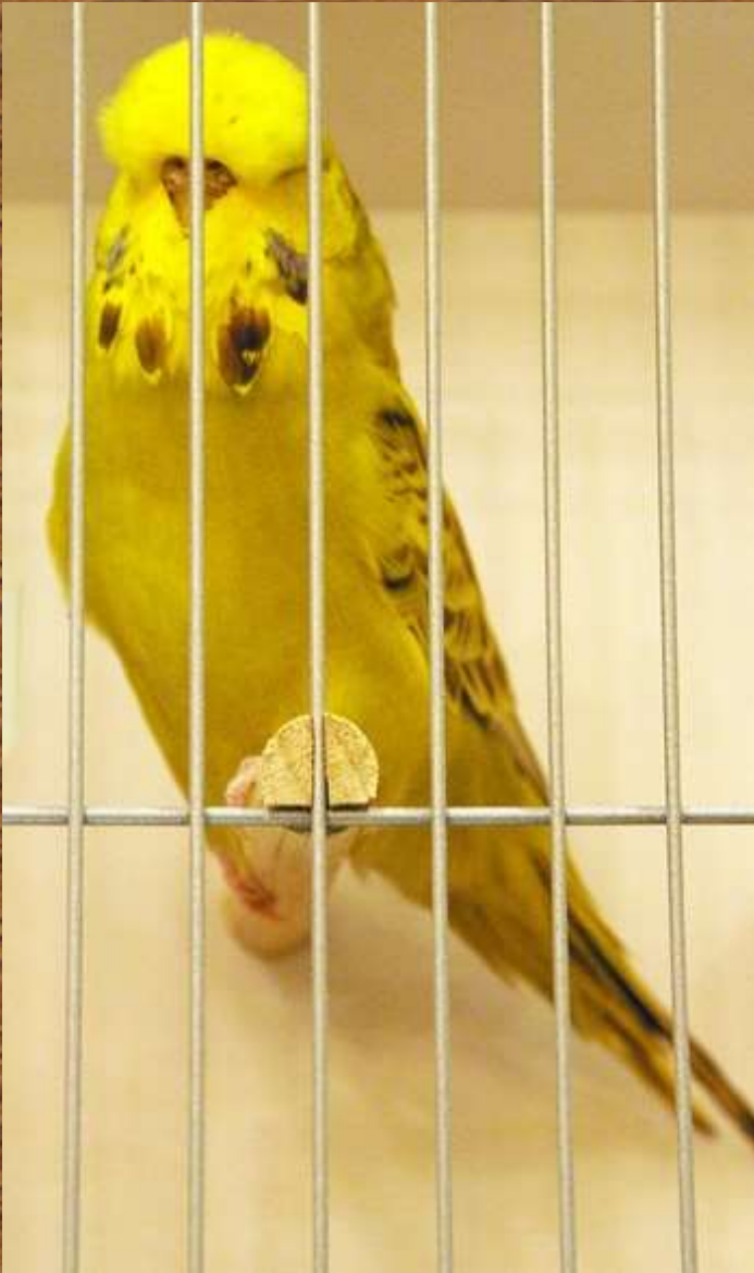
C & B Gearing WA