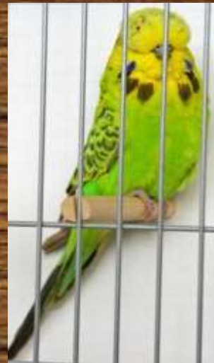
2010 Winner Kakoschke & Rice SA