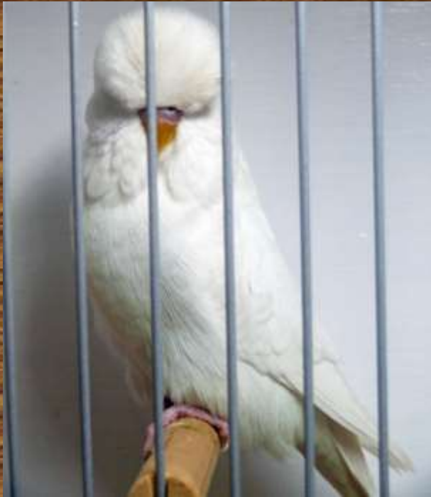
Len Bartz TBA