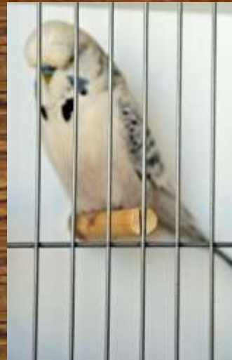
2010 Winner Wilson & Hoadley VIC