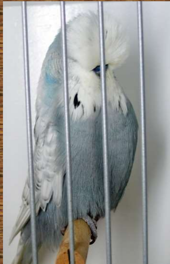
2011 Winner B & M Boal SQ