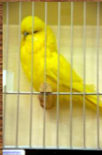
Spangle DF Charlie Chiang CBS