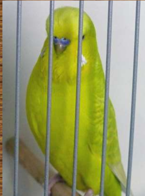
P Schellbach BNSBS