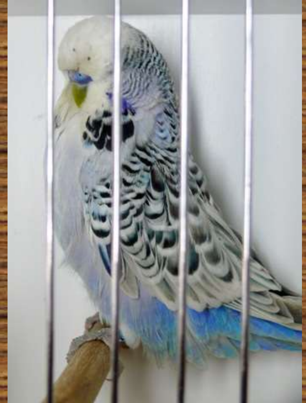
Mal Reid TBA