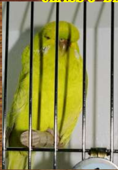
2005 Winner W & T Cusack NSW