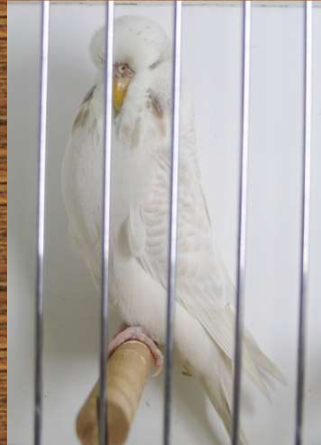
Camelle Lamb ABS