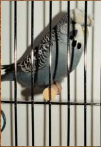
2004 Winner Painter & Bird NSW