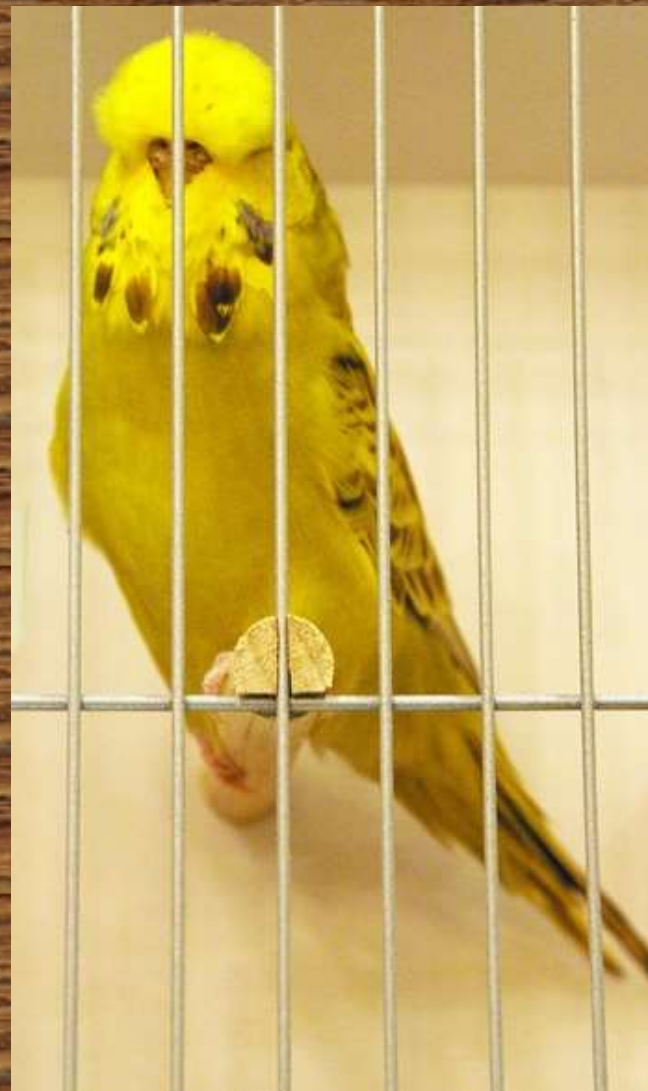
2011 Winner C & B Gearing WA