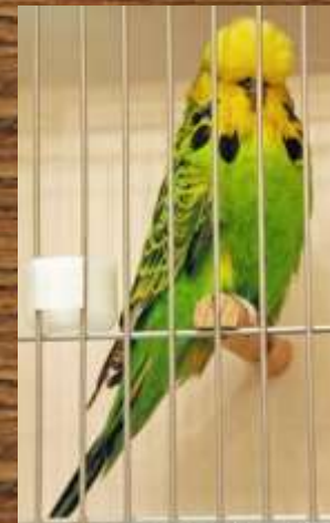
2011 Winner Kakoschke & Rice SA