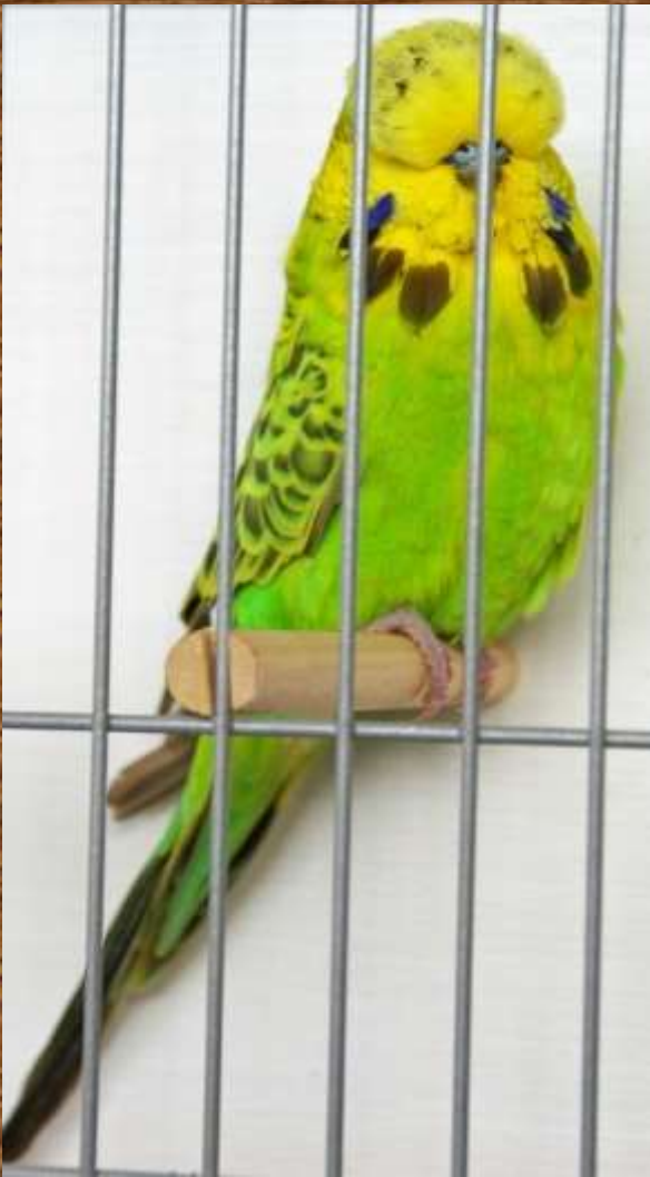
2010 Winner Kakoschke & Rice SA