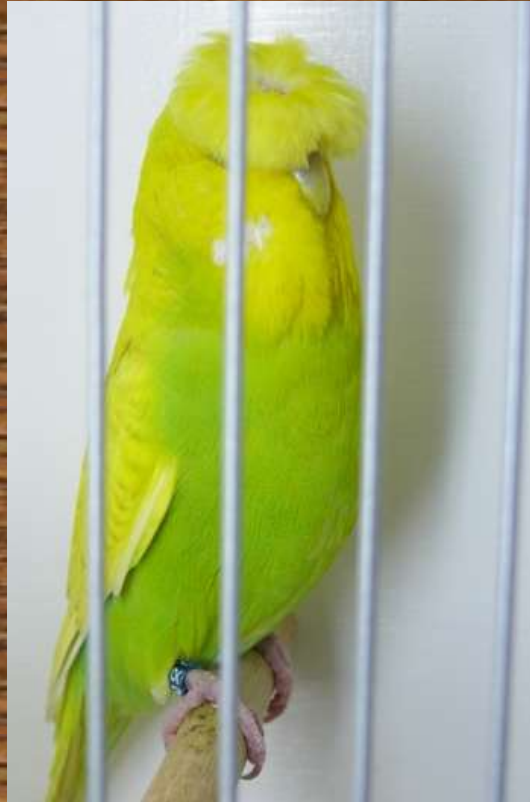
BENCHED Position 11 th