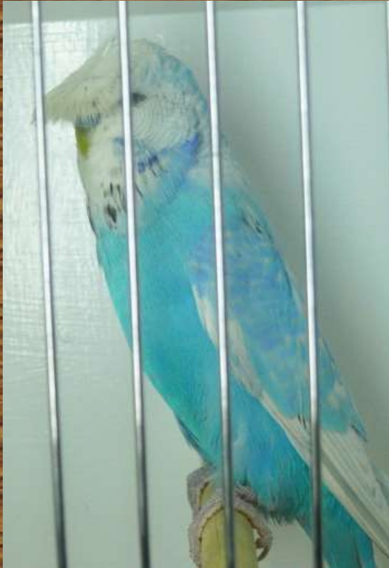
BENCHED Position 7 th