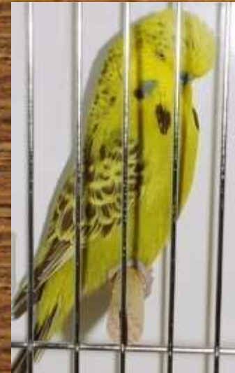
2007 Winner M & R Fellows NSW