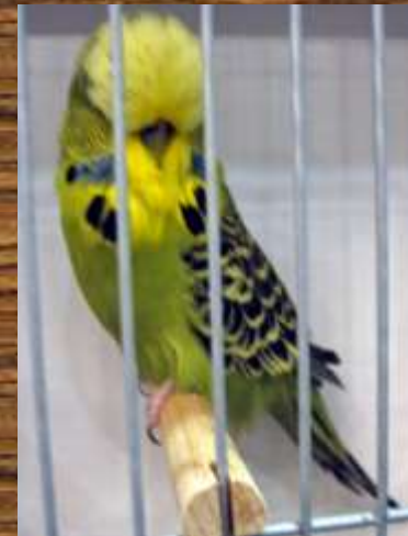
2011 Winner Welshman Family NSW