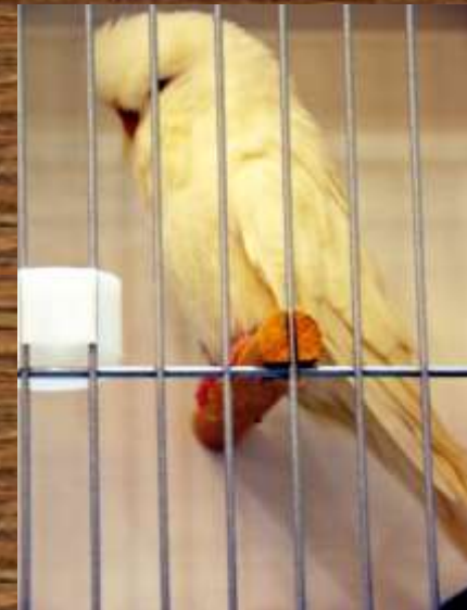
2011 Winner C & B Gearing WA