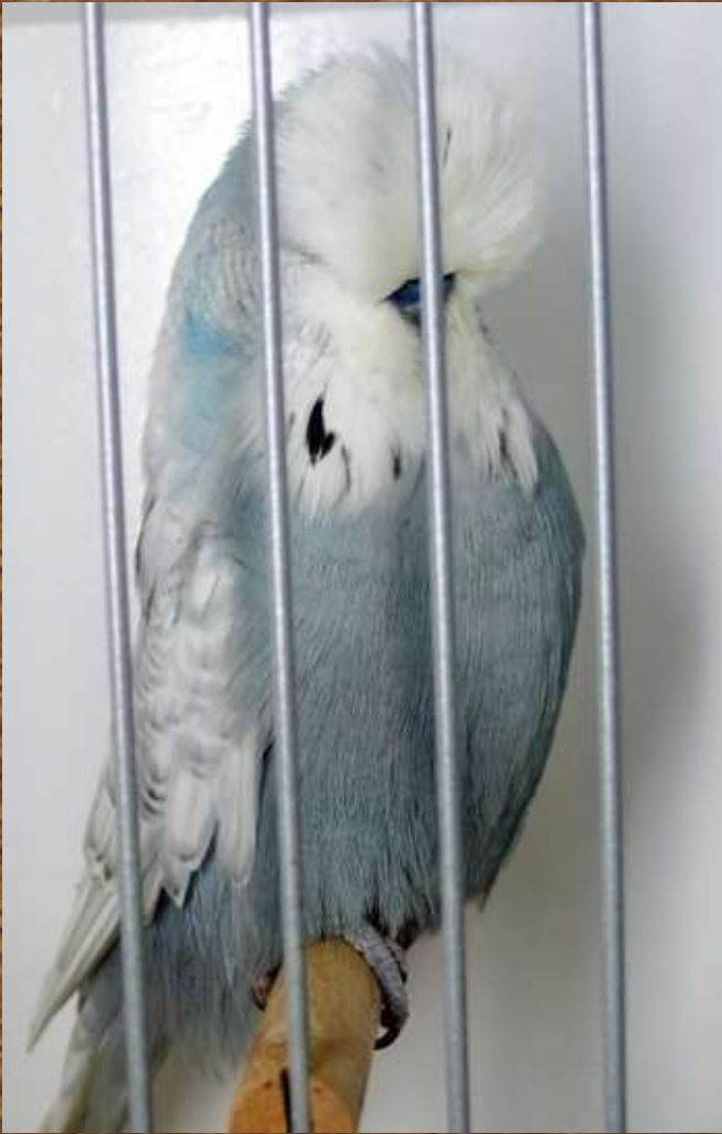
B & M Boal SQ