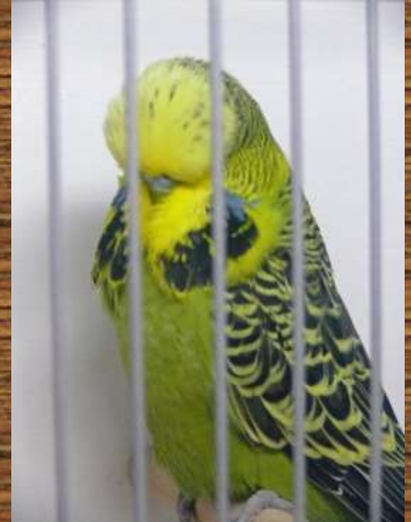
L & F PERCY (BCB)