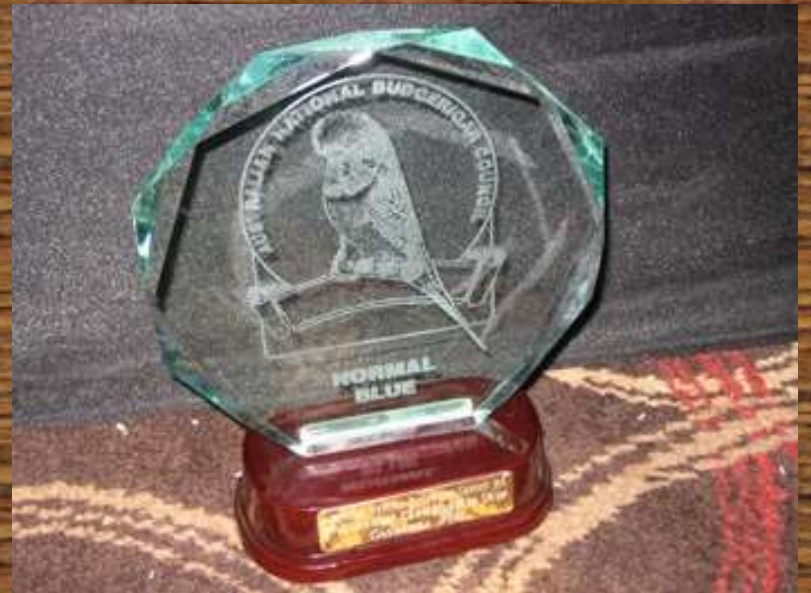
LOGIES & ROSETTES