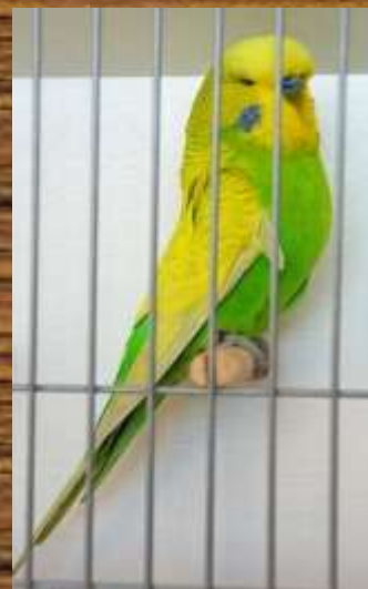
2010 Winner Kakoschke & Rice SA