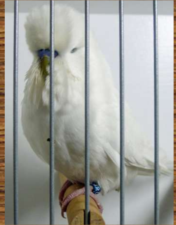
Alan Beutel TBS