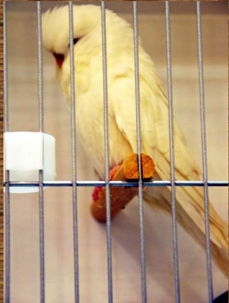
2011 Winner C & B Gearing WA