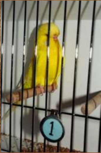
2004 Winner L Dixon SQ