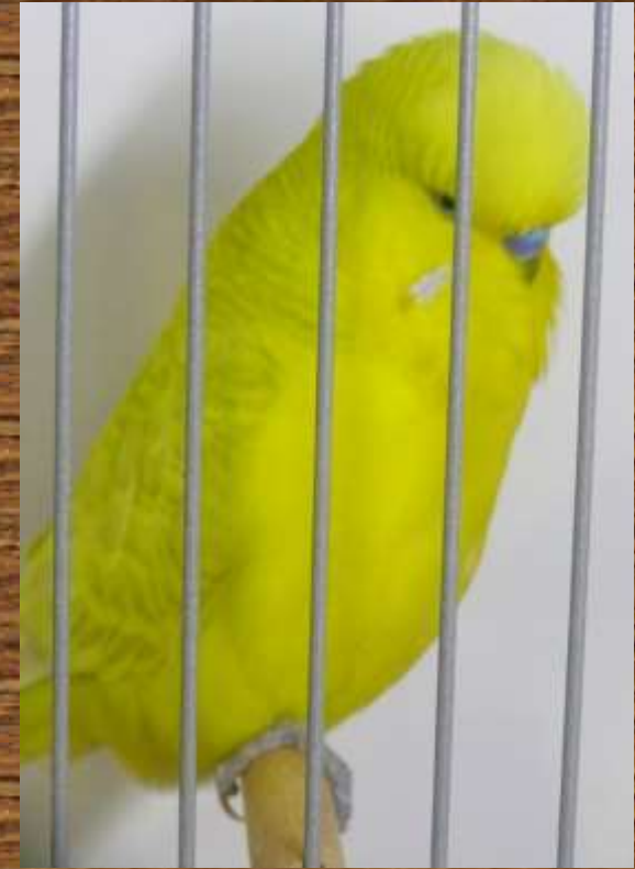
P Schellbach BNSBS