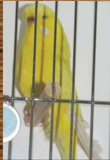
2006 Winner W & T Cusack NSW