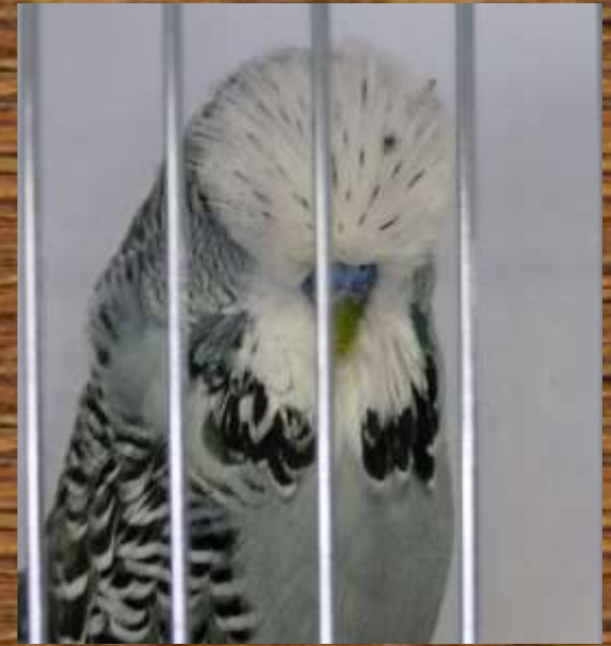
Mokrzecki & Wright (IBS)

Cage L Another impact bird. Length, cap/directional feather, good condition, show presence, showed well.