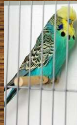
2010 Winner Wood & Drew VIC