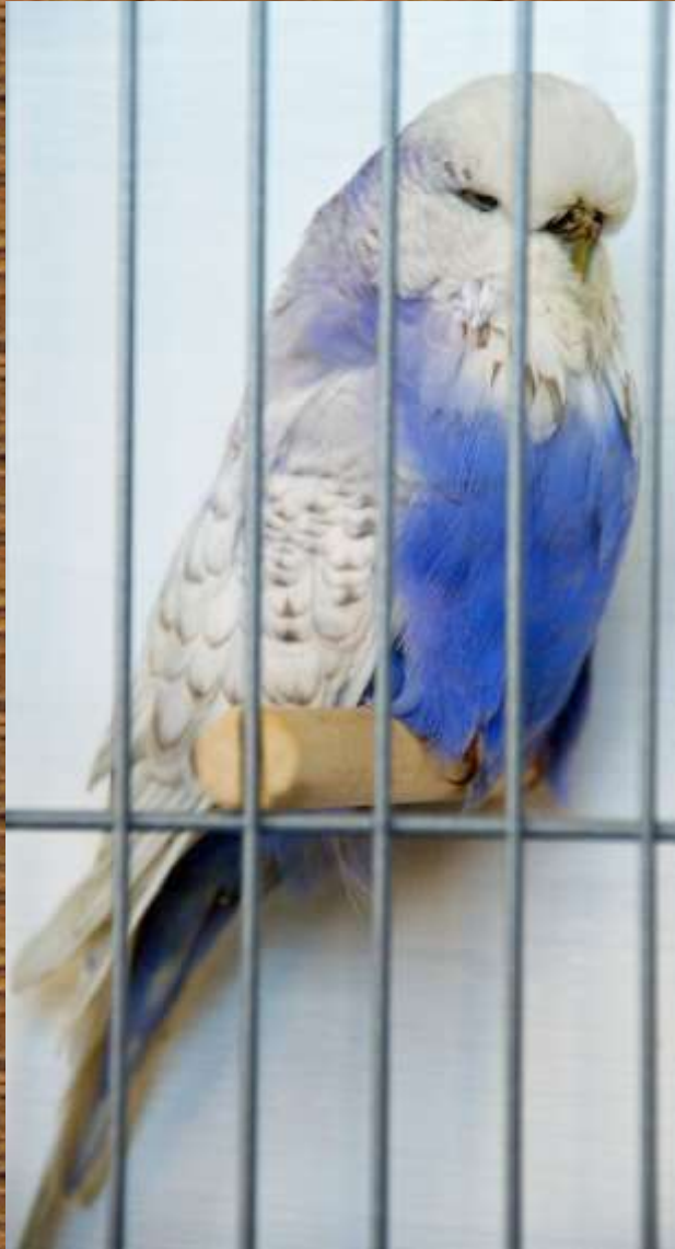
Henry George SQ