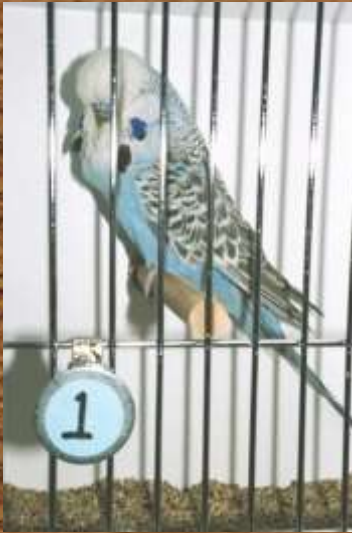
2003 Winner W Cappa NSW