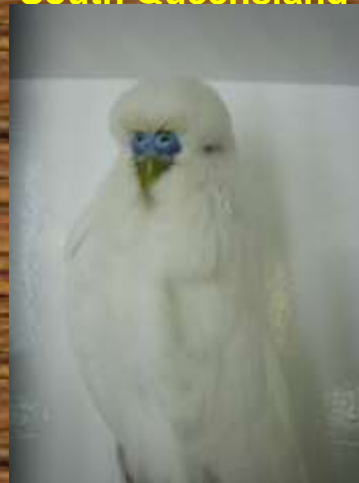
2009 Winner Charlton & Melbourne Vic