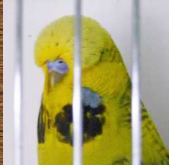
C&M Ault (WRBS)

Cage L Impact bird. Lovely face, a bit shorter in keel, lovely condition & variety Both birds benched were good examples of the variety, both very clean, no ticking/flecking.