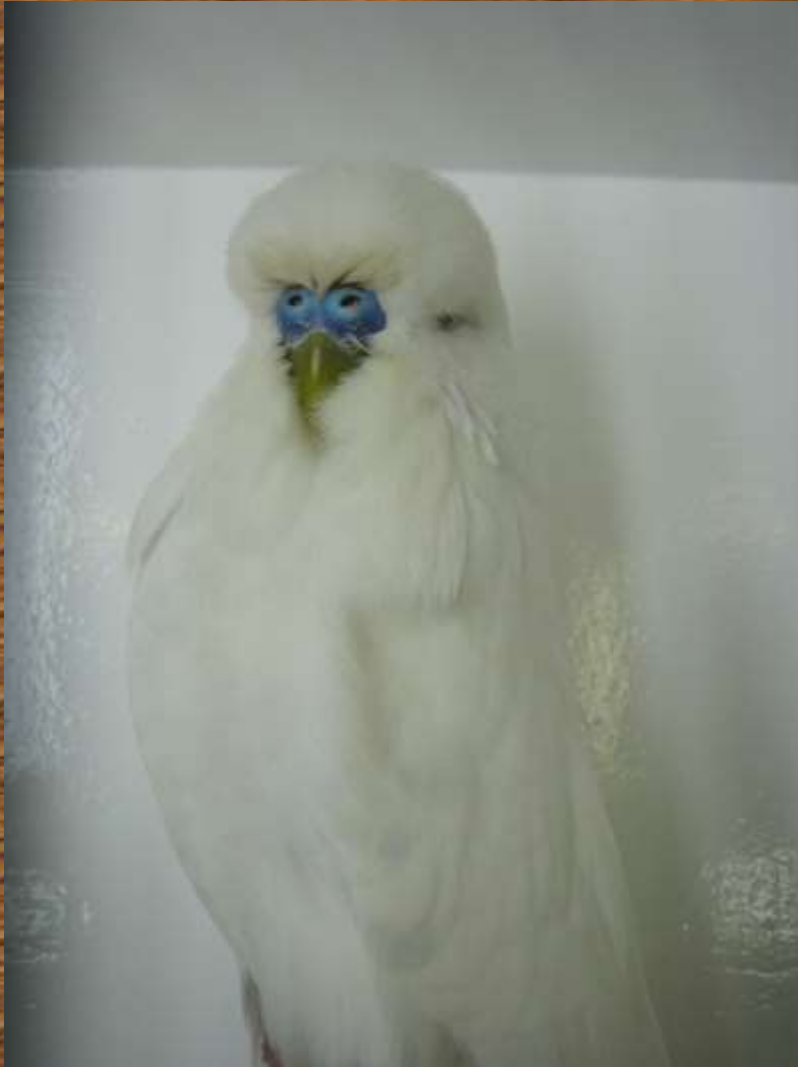
2009 Winner Charlton & Melbourne Vic