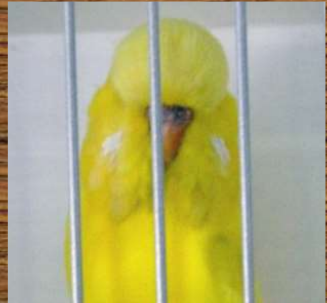
Camelle Lamb (ABS)

Cage F Good length, excellent condition, down in colour. Showed well in prep room.