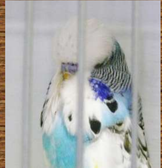
A Greber (SBS)

Not quite the visual impact as the 2 that were selected.