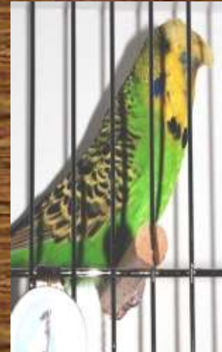
2006 Winner K Seacroft