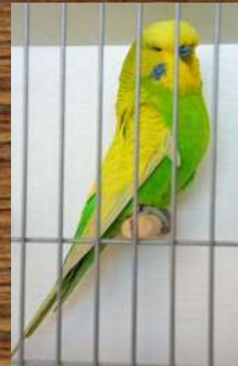
2010 Winner Kakoschke & Rice SA