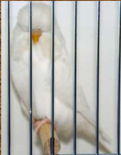
2007 Winner Marshall Family S.A