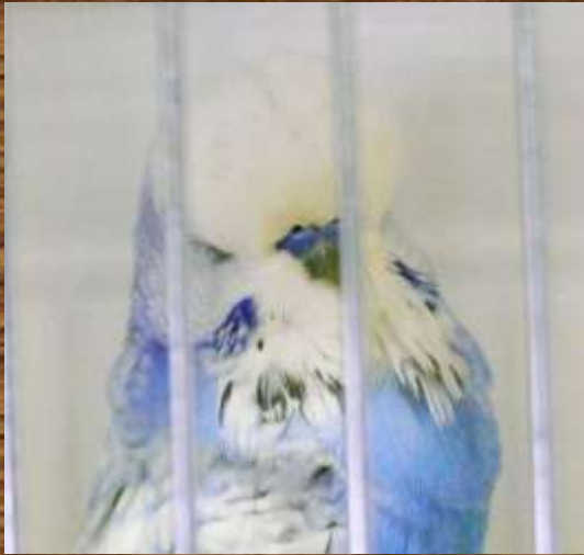
Henry George (BNSBS)

Unlucky that we could only bench 2. On the day the 2 birds benched showed more impact.