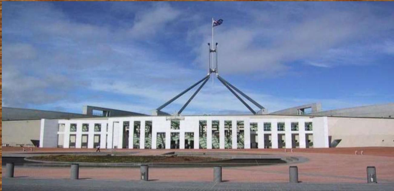
Parliament House – Canberra – Australia's National Capital

Hosted by Budgerigar Society of NSW Inc May 27 to June 2, 2011