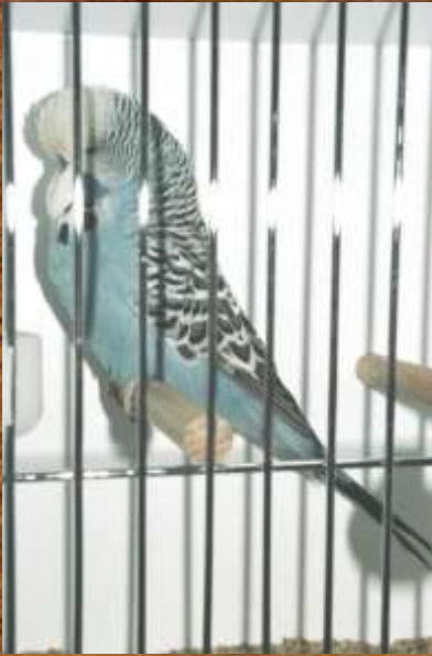
2003 Winner Alan Rowe