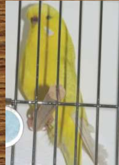
2006 Winner W & T Cusack NSW