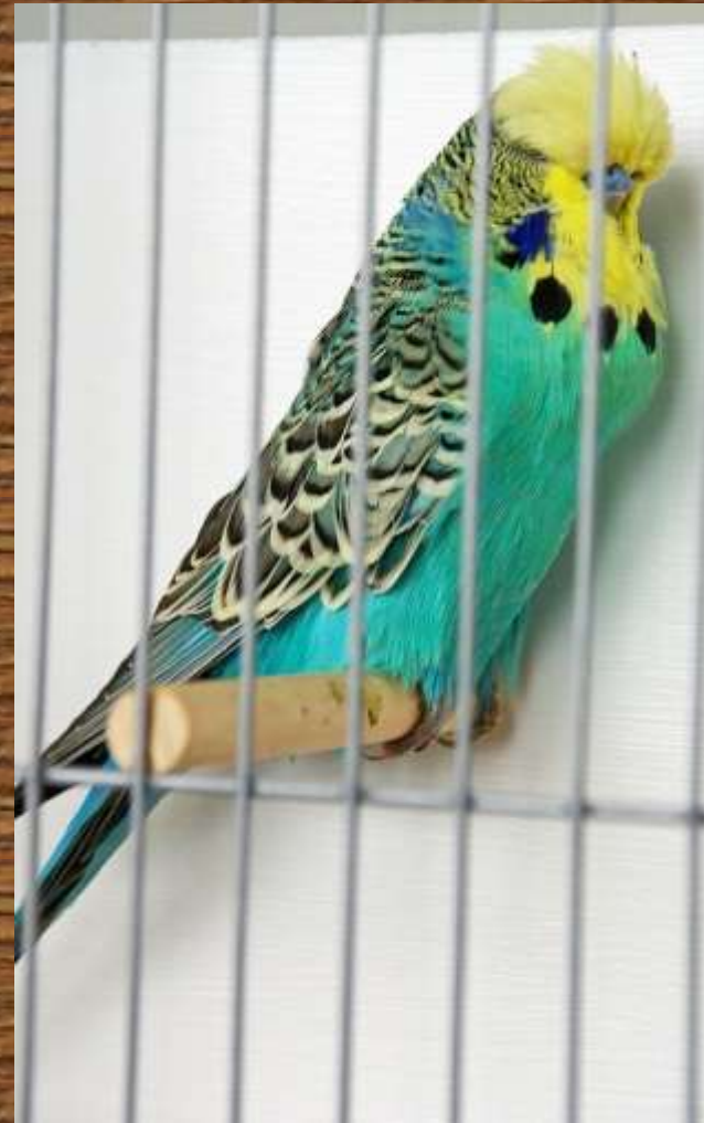
2010 Winner Wood & Drew Vic