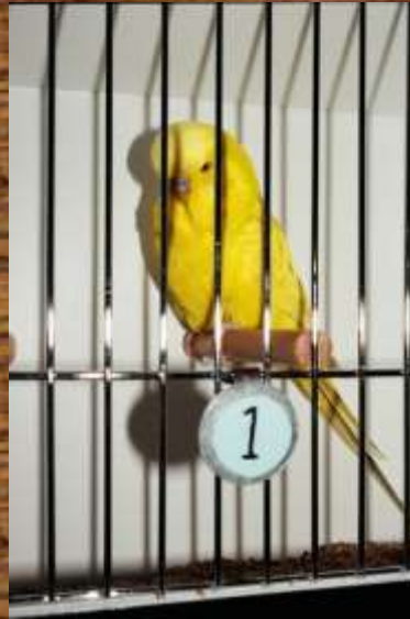
2004 Winner H Wood NSW