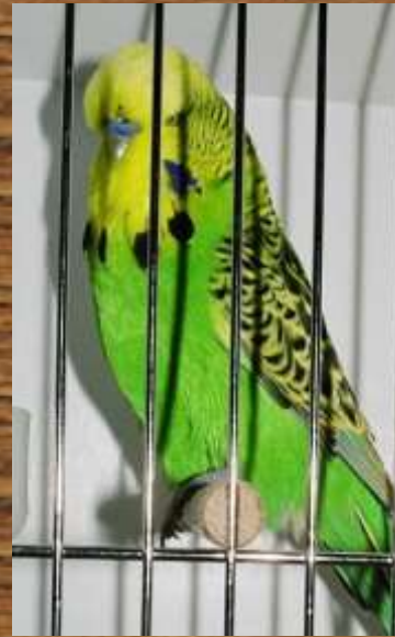
2005 Winner Kakoschke & Rice SA