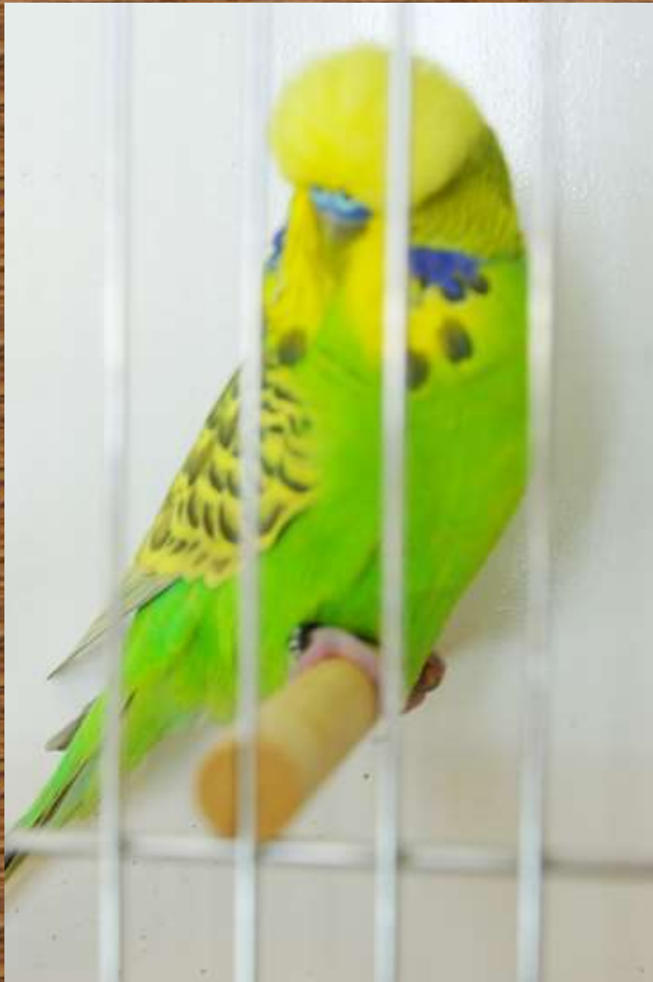
2009 Winner Wally Capper NSW