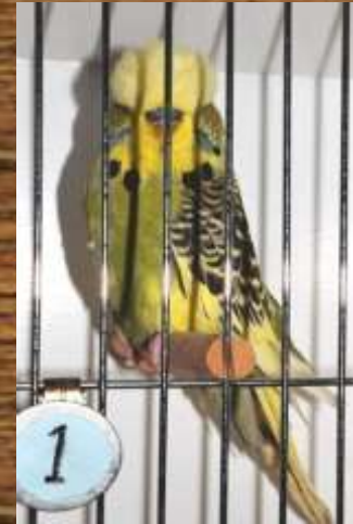
2006 Winner Blair & Poole Tasmania