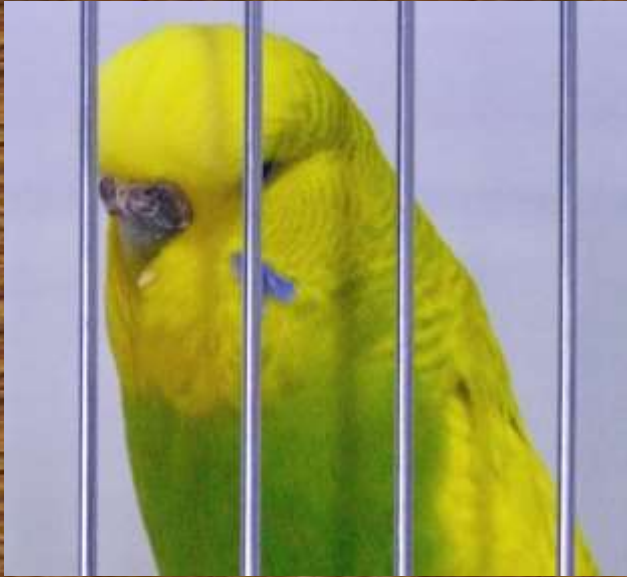
Henry George (BNSBS)

Cage A Good condition, variety, showed well in prep area