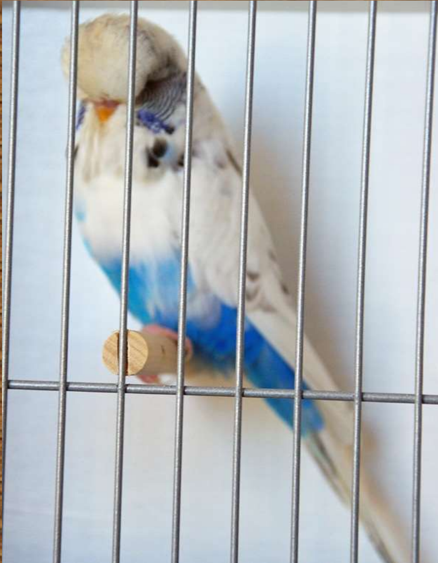
B Hunt VIC