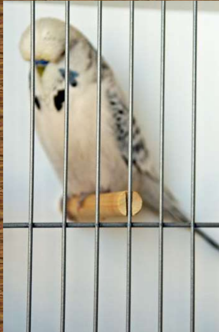
2010 Winner Wilson & Hoadley VIC