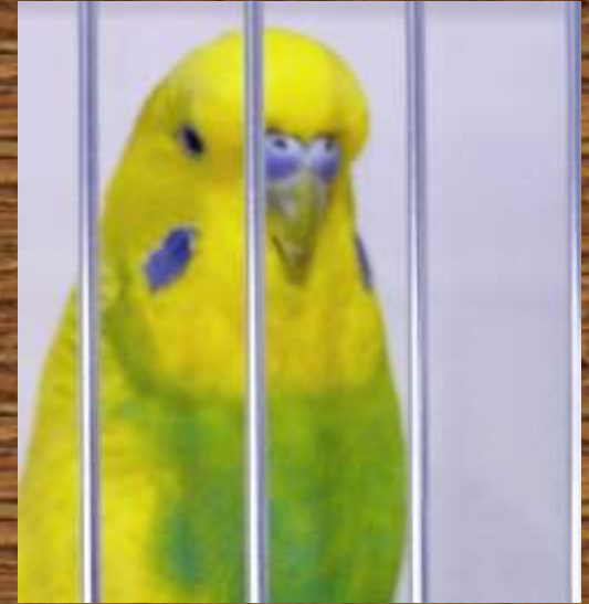
Peter Schellbach (BNSBS)

Unlucky to miss being benched. Not quite as steady as the other 2 in the prep area.