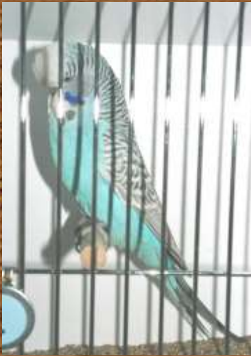
2003 Winner D Ganzer South Qld