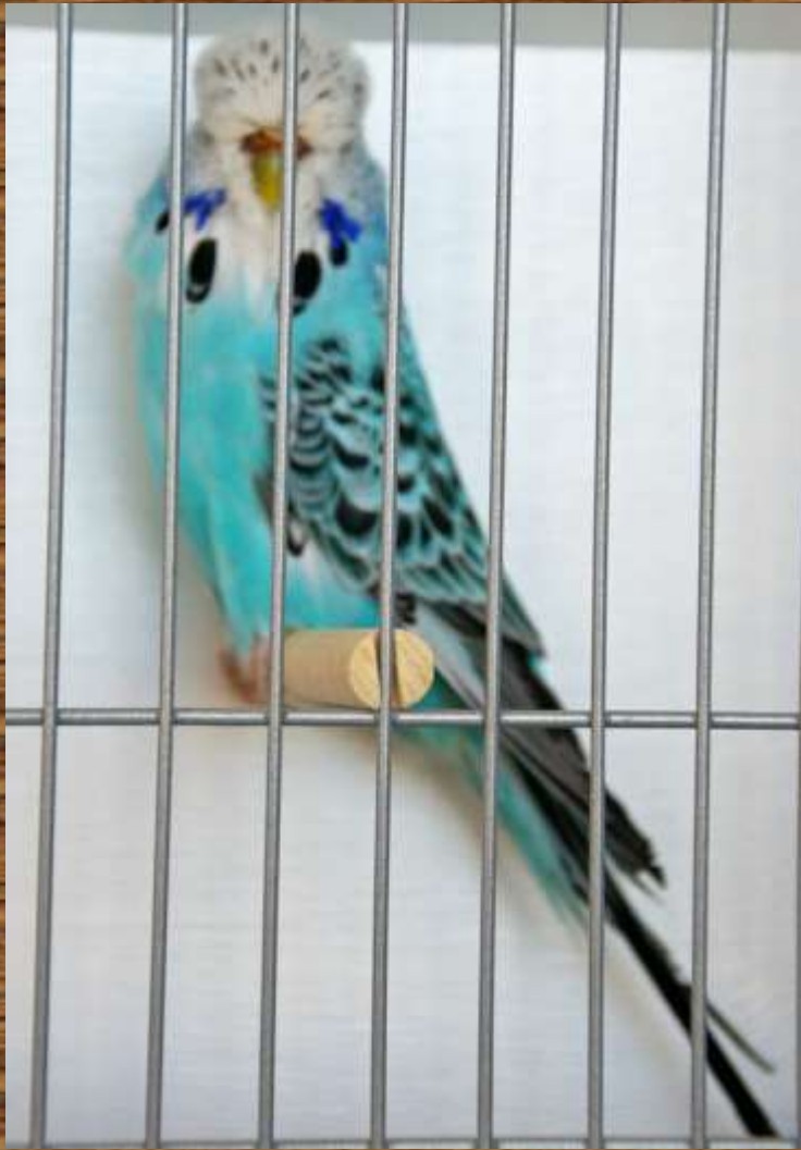
G & J Horrobin SQ