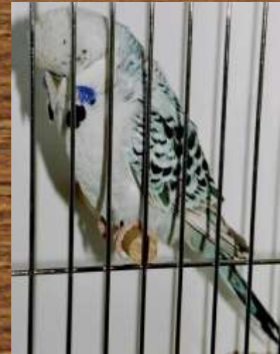
2007 Winner Church & O'Reilly SQ