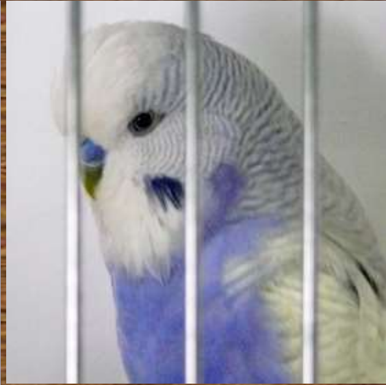
Keith Moreland (BNSBS)

Cage K Picked himself. Top condition, good contrast, variety. Showed well in prep area.