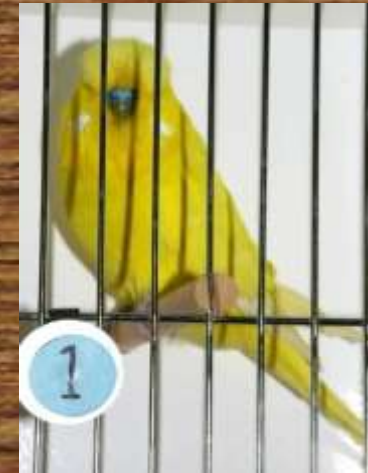
2006 Winner Dodgey Brothers West Aust