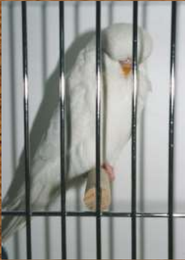
2003 Winner C & B Gearing WA