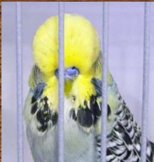
R Halloran (BSB)

Cage E Stronger cleaner YF, Showed consistently during preparation, stood strong and maintained consistency.