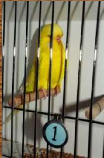
2004 Winner L Dixon SQ