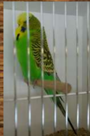
2009 Winner D&R Lange SA