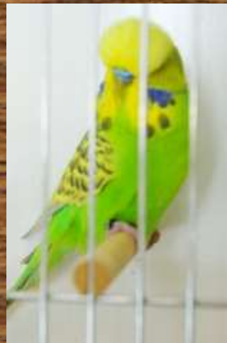
2009 Winner Wally Capper NSW