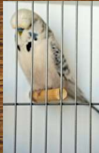
2010 Winner Wilson & Hoadley VIC