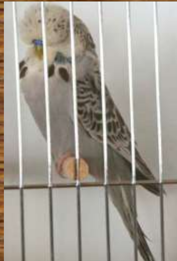
2008 Winner C & M Ault South Qld