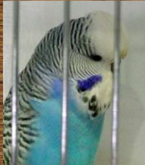
B&D McClennan (BNSBS)

Our best variety bird, but was smaller and lacked necessary impact. Judges comments were they were looking for the modern bird.