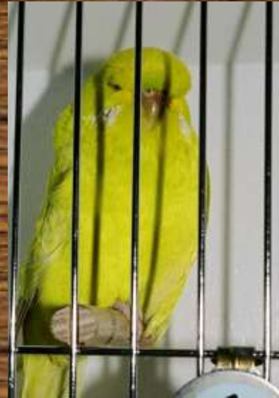
2005 Winner W & T Cusack NSW