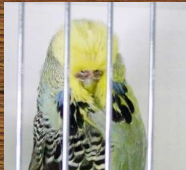
Garry Menzies (BNSBS)

Cage M Hen had facial features of square head and feather length, mask and spots were strong and maintained the positive showing to give her the edge over 3 rd bird.