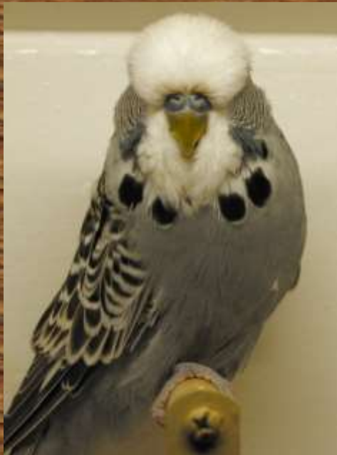
2004 Winner C & B Gearing WA