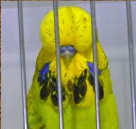
W&G Robinson (WRBS)

Cage E Good variety & condition. Only 1 tail feather, showed well in prep area.