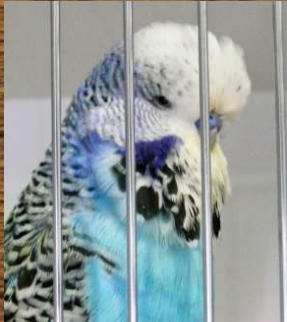
W & K STEPHEN (IBS)