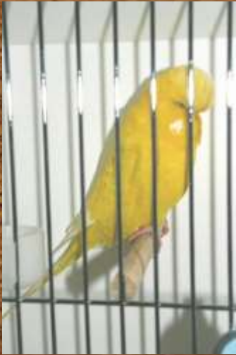
2003 Winner K Pullen Vic