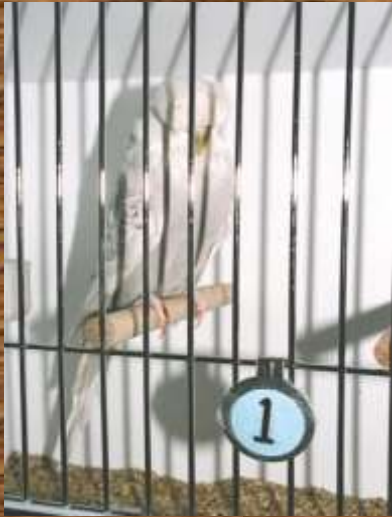
2003 Winner G Armstrong West Aust