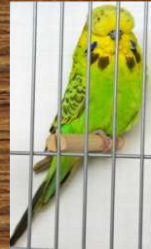
2010 Winner Kakoschke & Rice SA