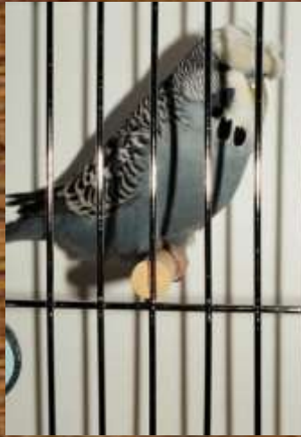
2004 Winner Painter & Bird NSW