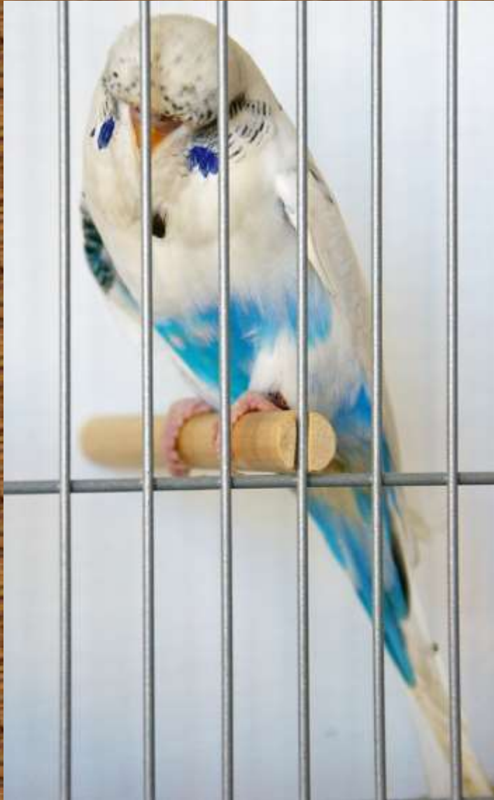
Wood & Drew VIC