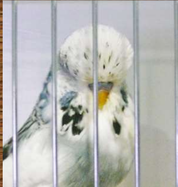
Jim Parish (ABS)

Cage I Selected himself as the second bird. Showed well in prep room. Didn't perform as well on show bench.