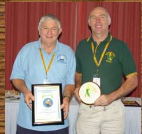
Clearwing Winner TAS Blair & Poole