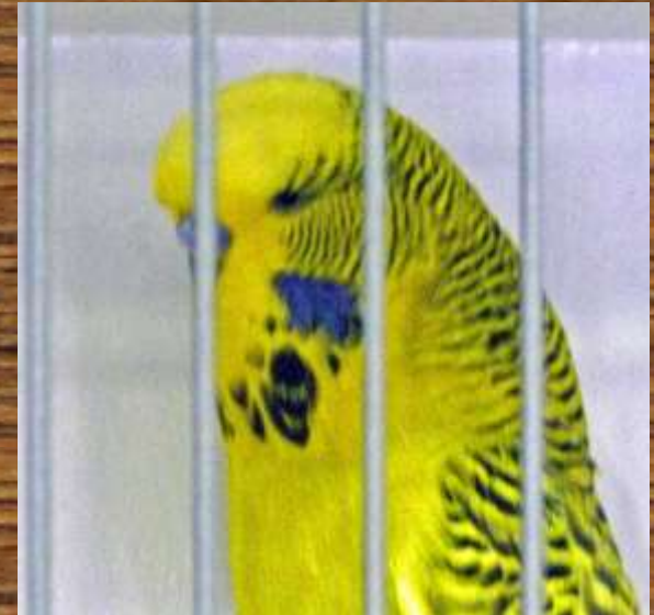
Yohanna Cooke (ABS)