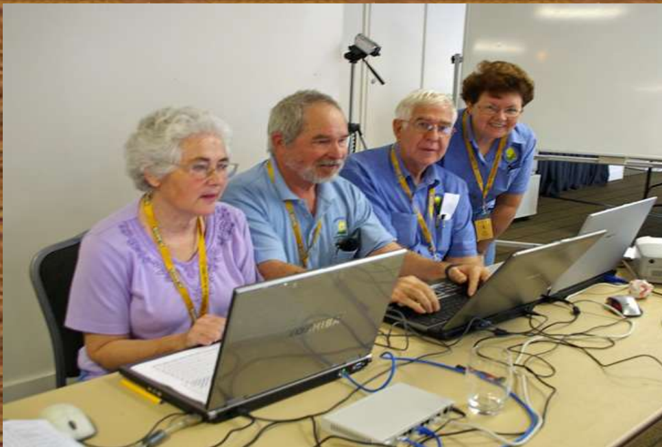
ALWAYS IN FRONT OF A SCREEN