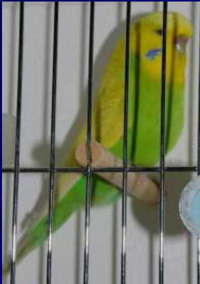
2006 Winner Crichton Family Tasmania