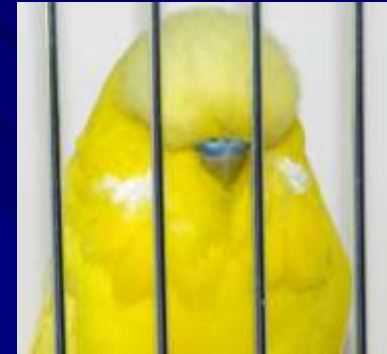
Spangle D/F Plunkett & Tasi NSW