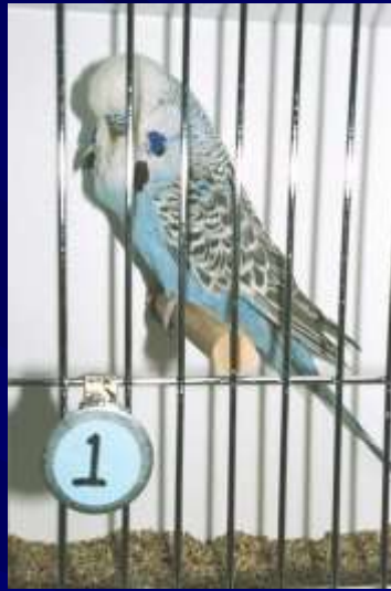
2003 Winner W Cappa NSW