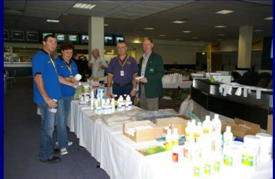
Trade Table Chapman Pet Care