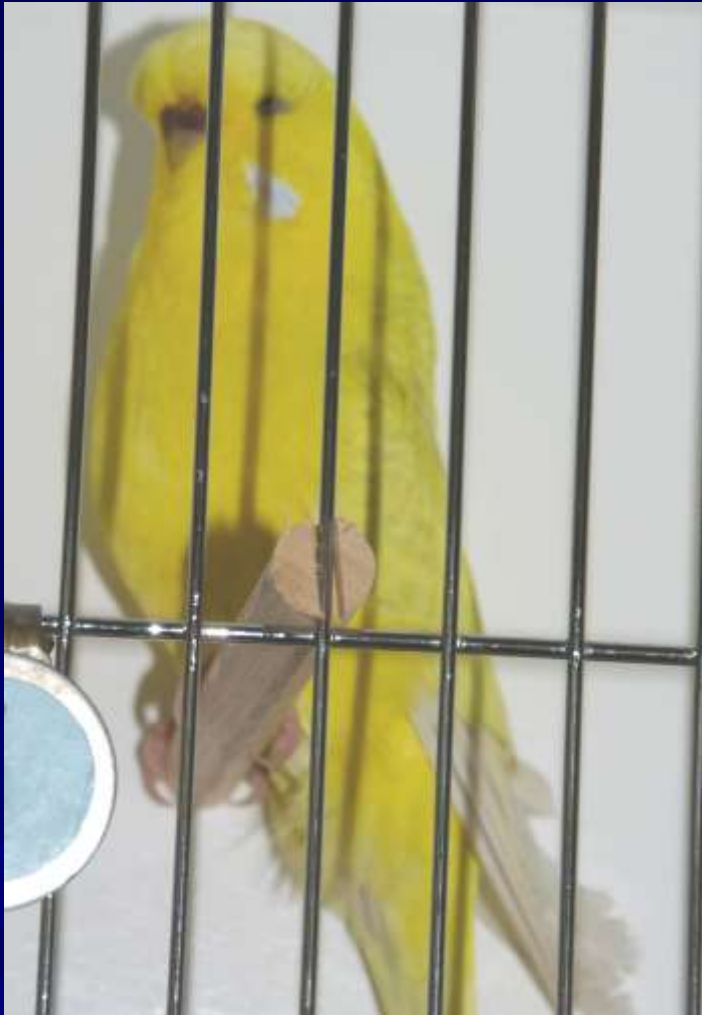
2006 Winner W Cusack NSW