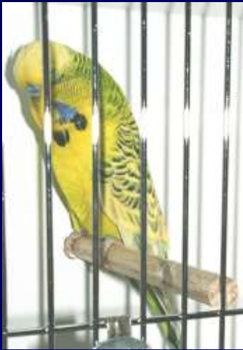
2003 Winner G O'Connell Vic (Exhibition Class Only)