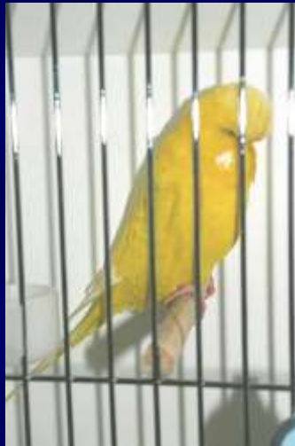
2003 Winner K Pullen Vic