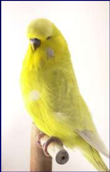
2002 Winner T & R MILLS NSW