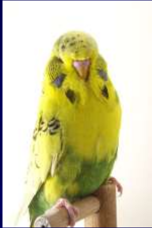
2002 Winner Wood & Keane NSW