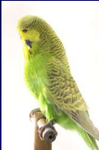
2002 Winner A BROWN VIC