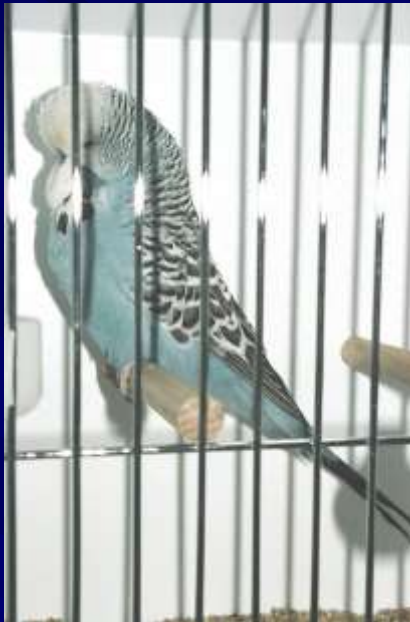
2003 Winner Alan Rowe