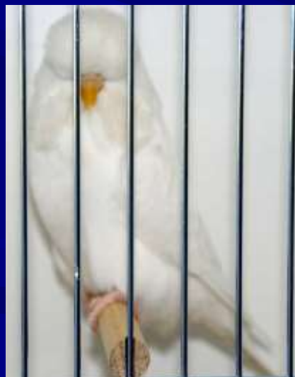
2007 Winner Marshall Family S.A