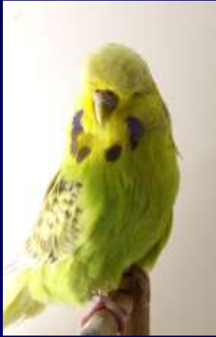
2002 Winner Charlton & Melbourne VIC