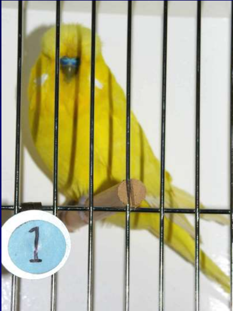
2006 Winner Dodgey Brothers West Aust