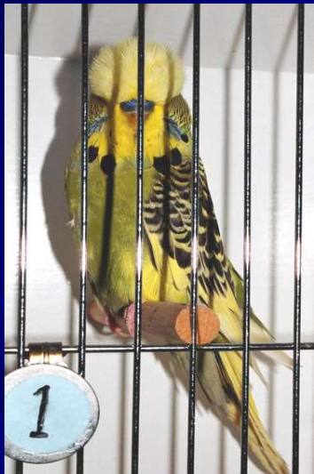
2006 Winner Blair & Poole Tasmania