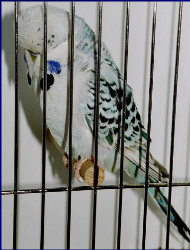
2007 Winner Church & O'Reilly SQ