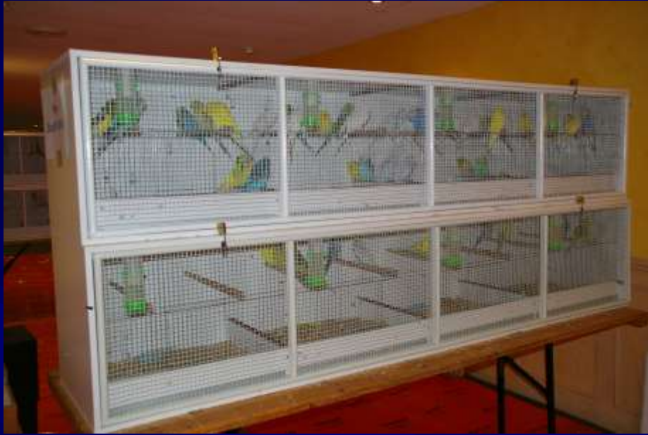
TEAM HOLDING CAGES