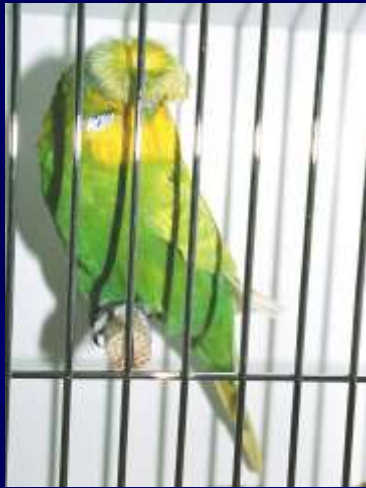
2003 Winner Kakoschke & Rice SA