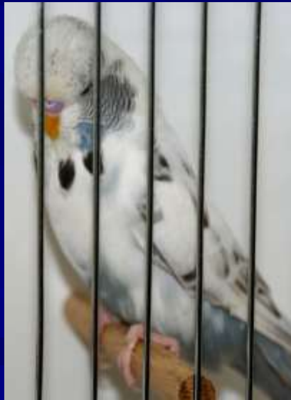
2007 Winner Home & Howard Tas