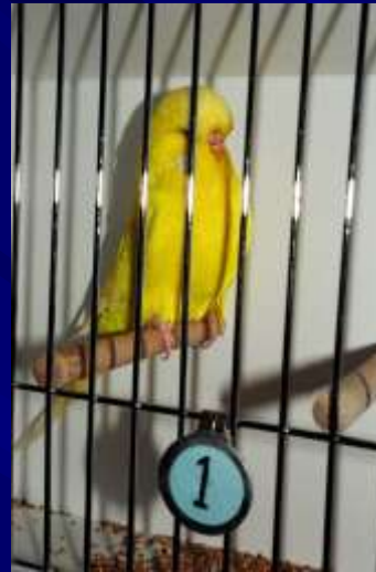
2004 Winner L Dixon SQ