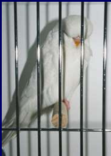
2003 Winner C & B Gearing WA