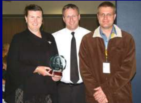
Opaline AOSV M & R Fellows NSW