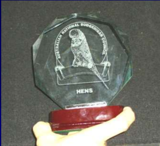
The Holy Grail