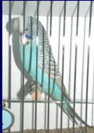
2003 Winner D Ganzer South Qld