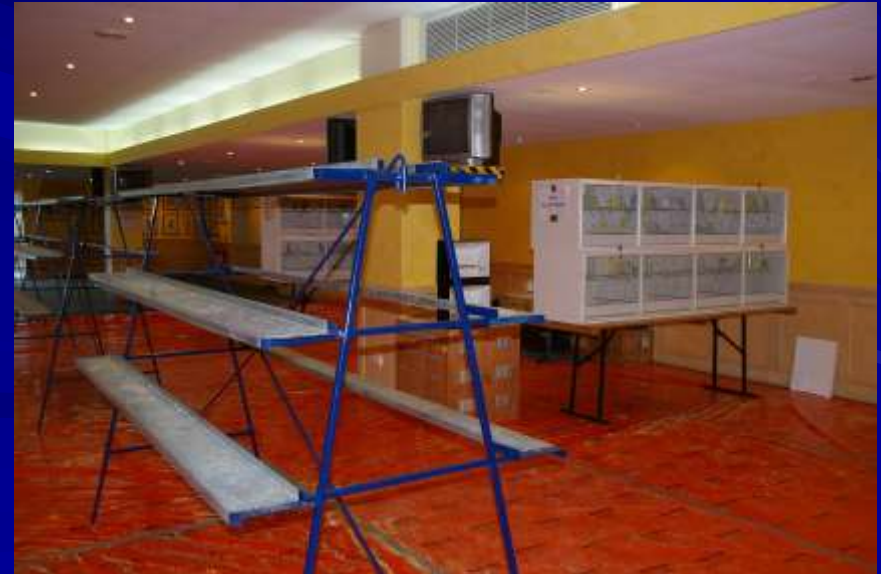
LARGE HOLDING & SECURITY ROOM