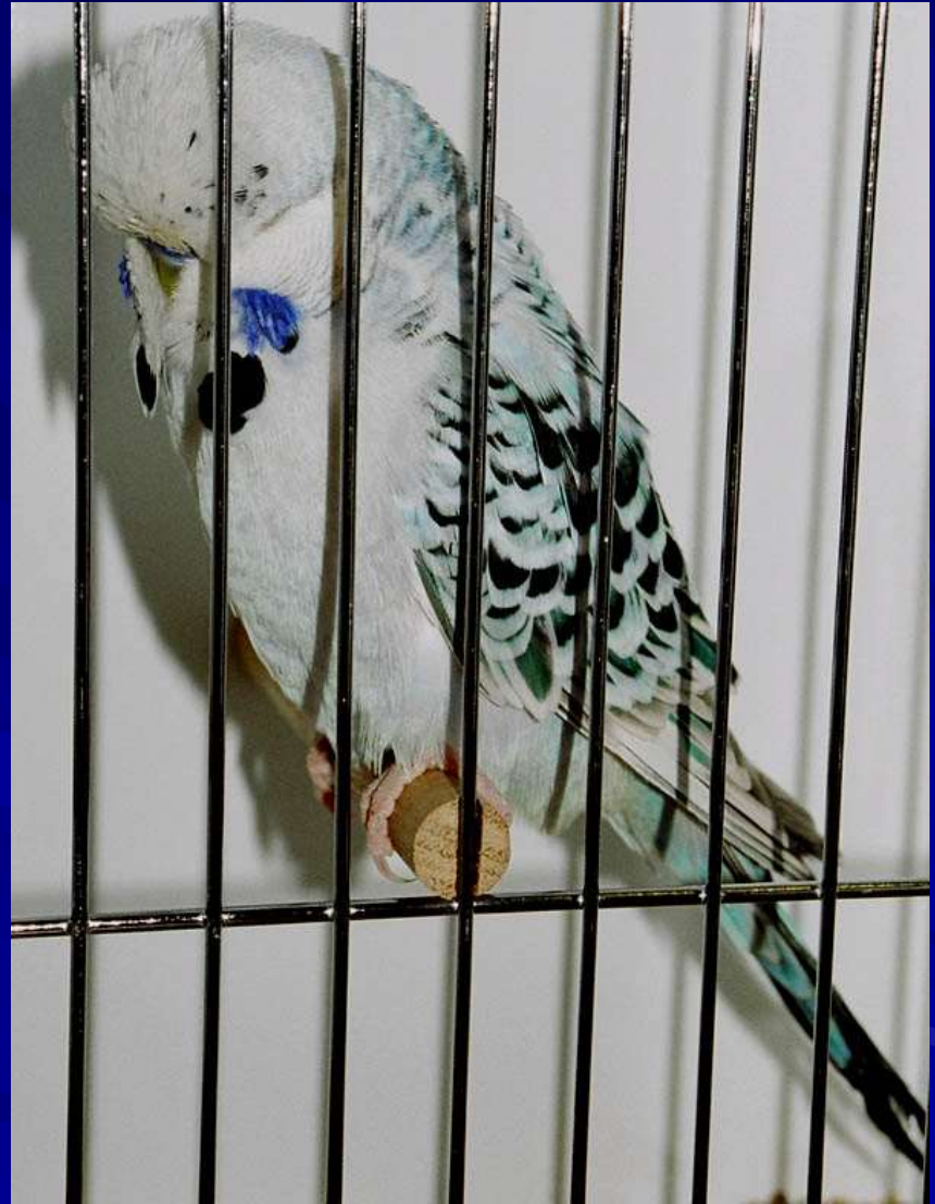
2007 Winner Church & O'Reilly SQ