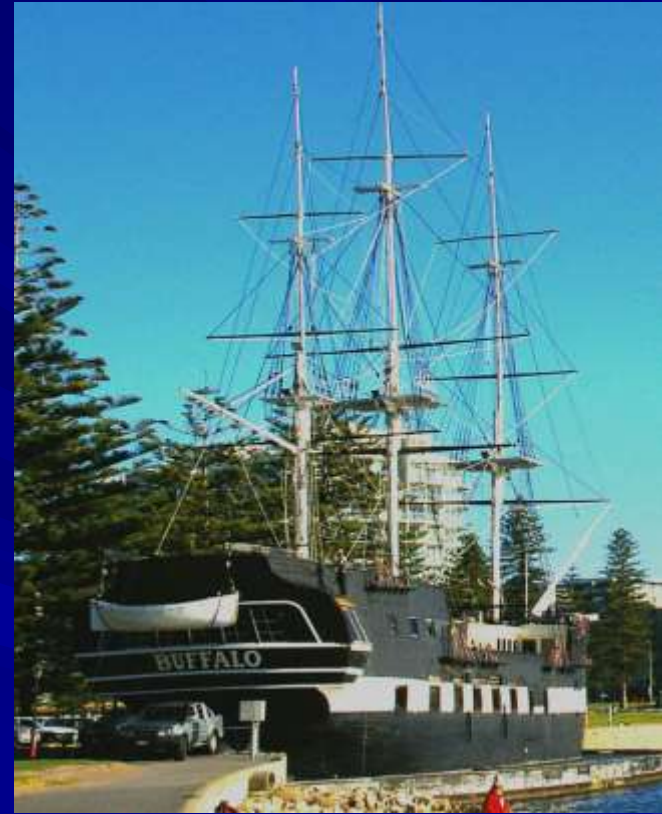
Family Restaurant on the foreshore