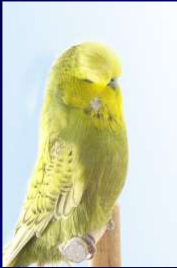
2002 Winner G Armstrong WA