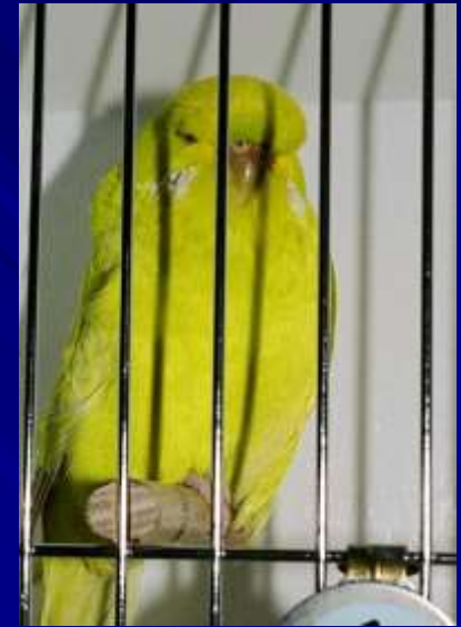
2005 Winner W & T Cusack NSW