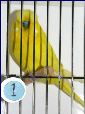
2006 Winner Dodgey Brothers West Aust