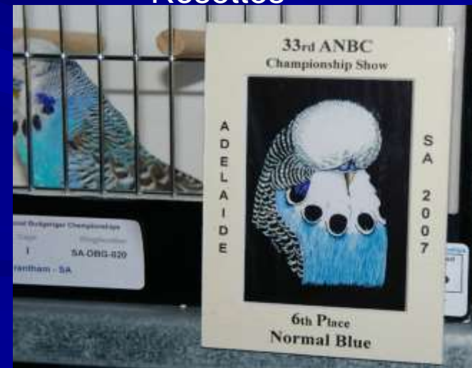
Memento Fridge Magnet