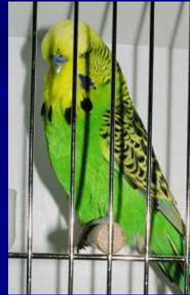
2005 Winner Kakoschke & Rice SA