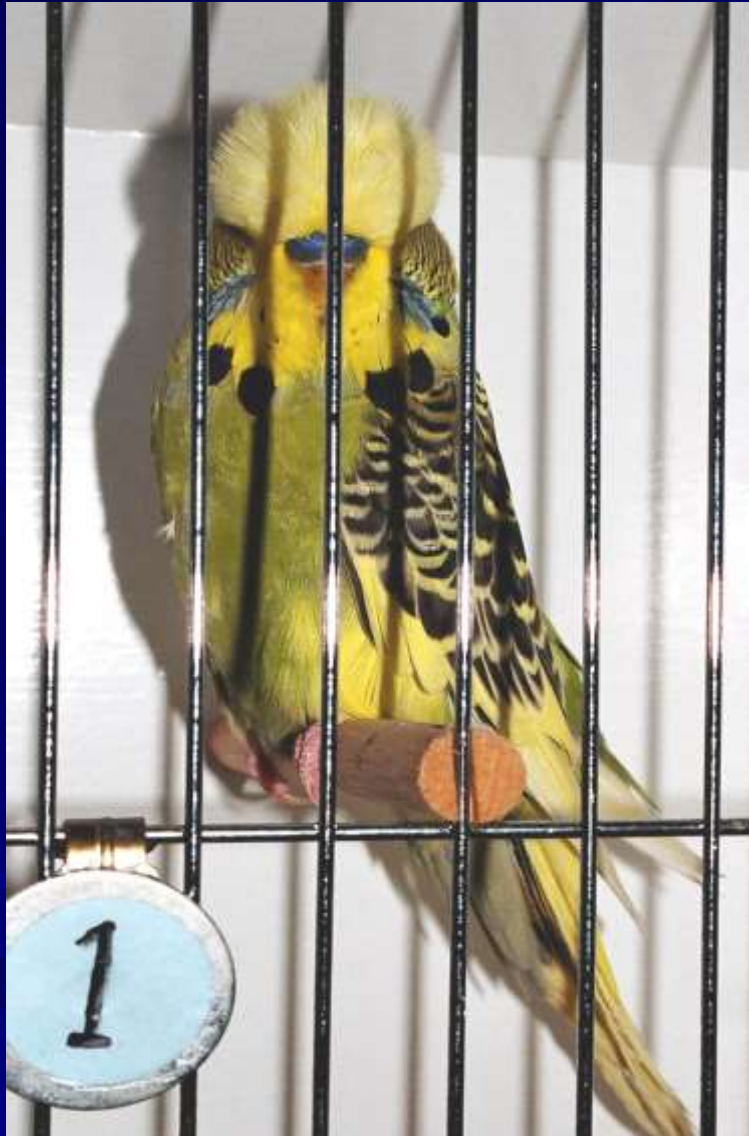
2006 Winner Blair & Poole Tasmania