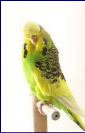
2002 Winner S & C Norris STH AUST