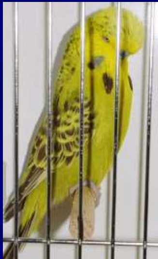
2007 Winner M & R Fellows NSW