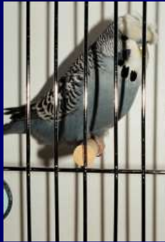
2004 Winner Painter & Bird NSW