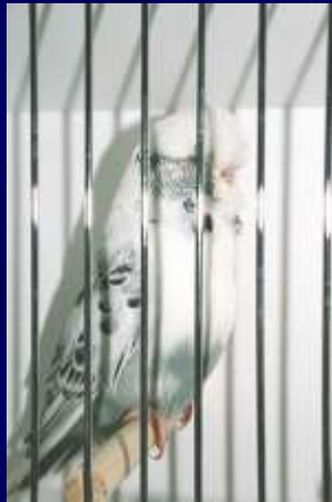
2003 Winner Capasso & Butters NSW