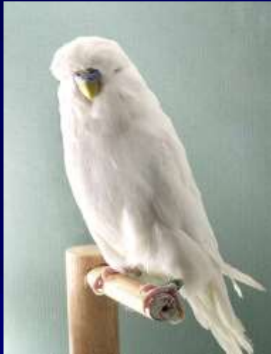
2002 Winner G Armstrong WA