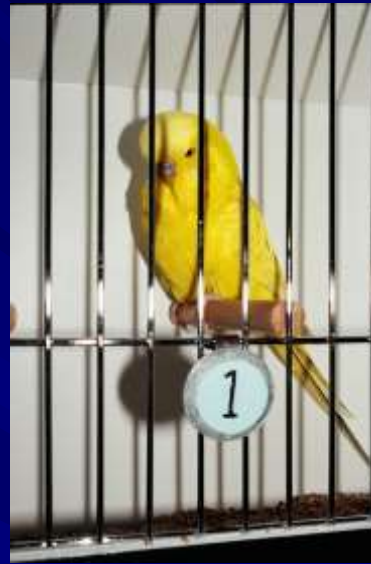
2004 Winner H Wood NSW