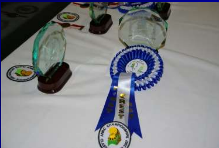
Rosettes & Logie