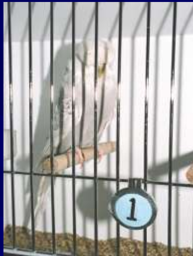
2003 Winner G Armstrong West Aust