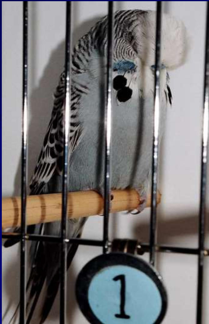
2006 Winner A & C Druery New South Wales