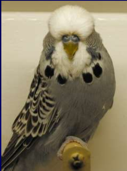
2004 Winner C & B Gearing WA