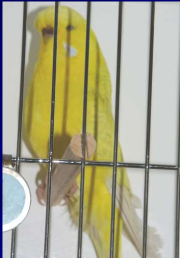
2006 Winner W & T Cusack NSW