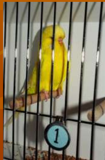
2004 Winner L Dixon SQ