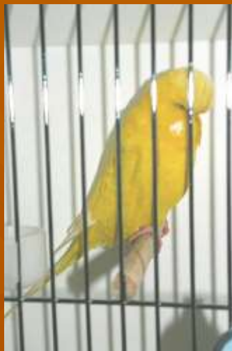
2003 Winner K Pullen Vic