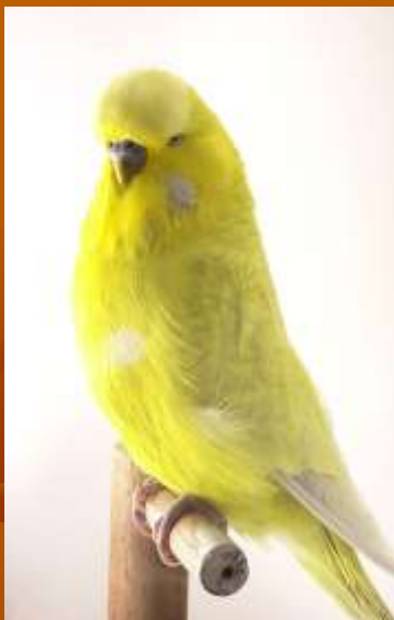
2002 Winner T & R MILLS NSW