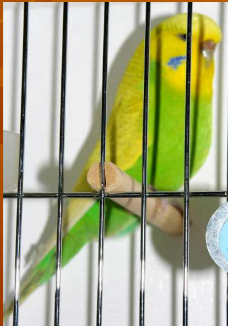
2006 Winner Crichton Family Tasmania