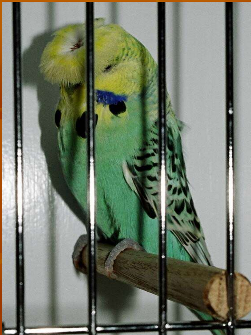
2005 Winner Kakoschke & Rice SA