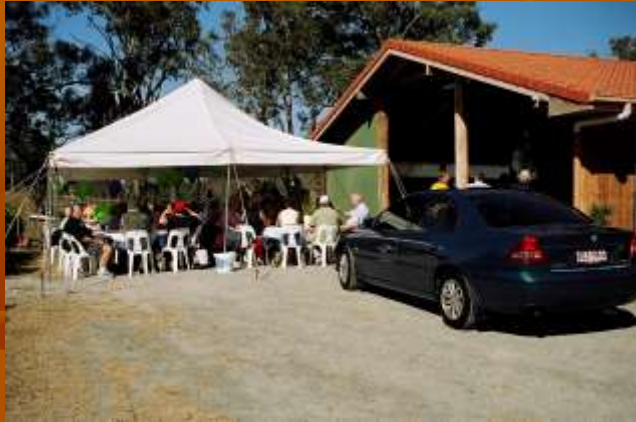
Enjoying a Sausage Sizzle