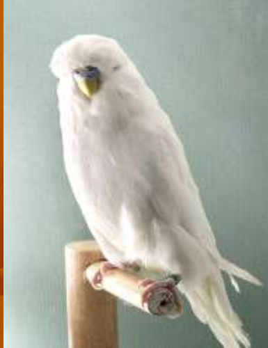
2002 Winner G Armstrong WA