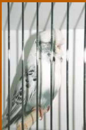
2003 Winner Capasso & Butters NSW