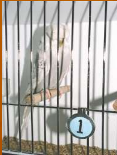
2003 Winner G Armstrong West Aust