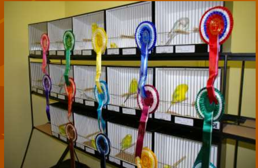
Rosettes from United Kingdom