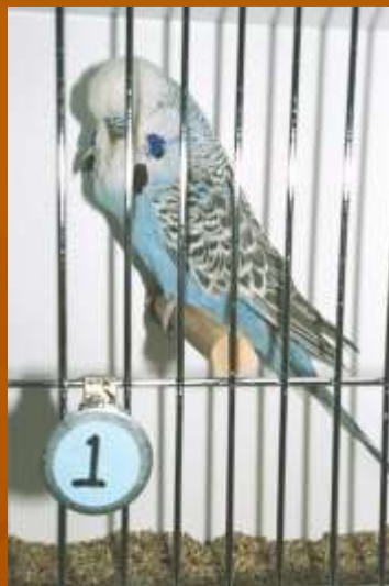
2003 Winner W Cappa NSW