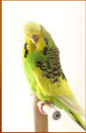
2002 Winner S & C Norris STH AUST