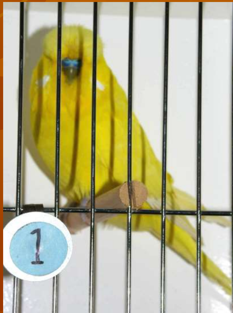
2006 Winner Dodgey Brothers West Aust