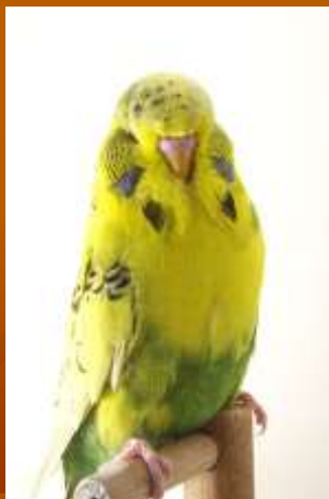
2002 Winner Wood & Keane NSW