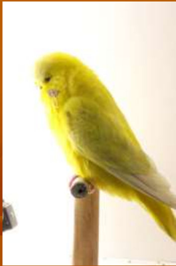
2002 Wilson & Hoadley VIC