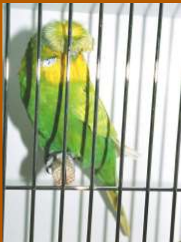
2003 Winner Kakoschke & Rice SA