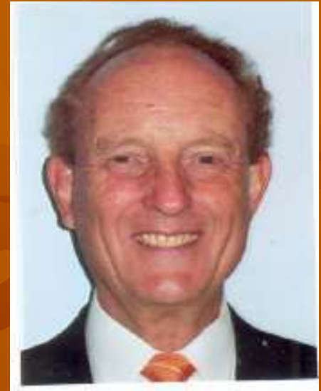
Henry George SQ