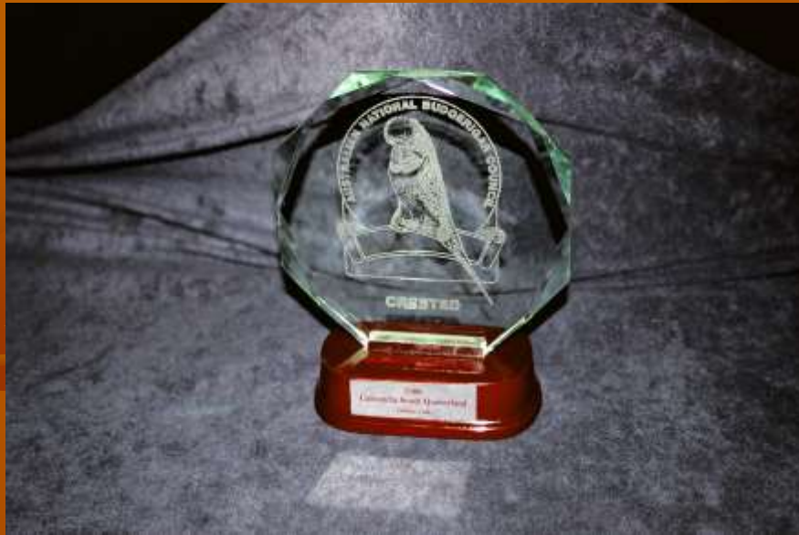
The New Logie