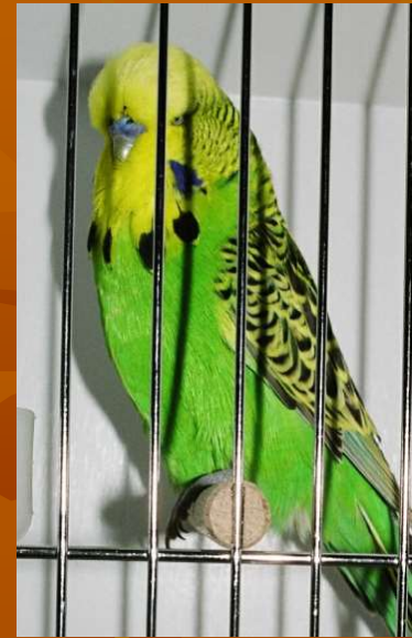
2005 Winner Kakoschke & Rice SA