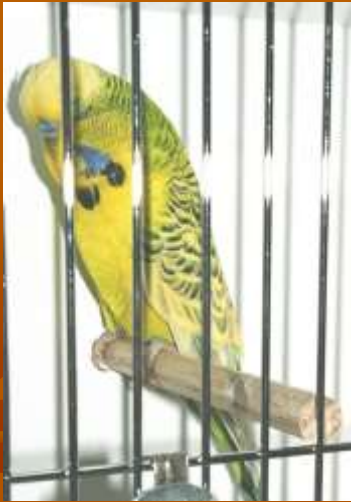
2003 Winner G O'Connell Vic (Exhibition Class Only)