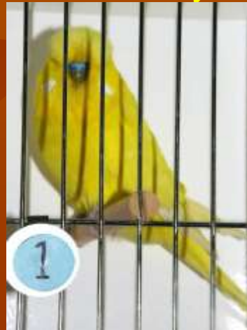
2006 Winner Dodgey Brothers West Aust