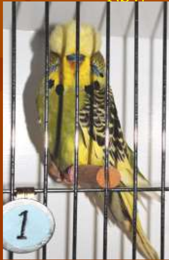
2006 Winner Blair & Poole Tasmania