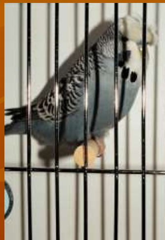
2004 Winner Painter & Bird NSW