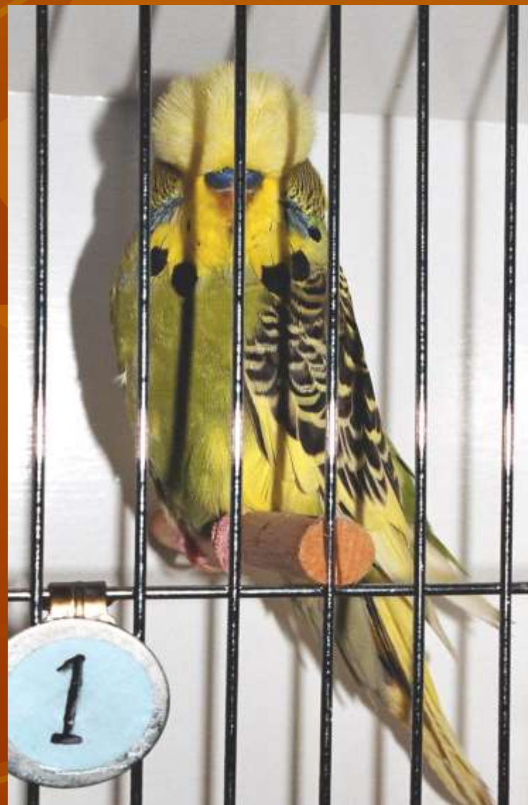
2006 Winner Blair & Poole Tasmania