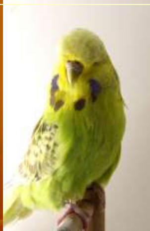
2002 Winner Charlton & Melbourne VIC