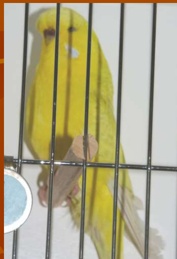
2006 Winner W & T Cusack NSW