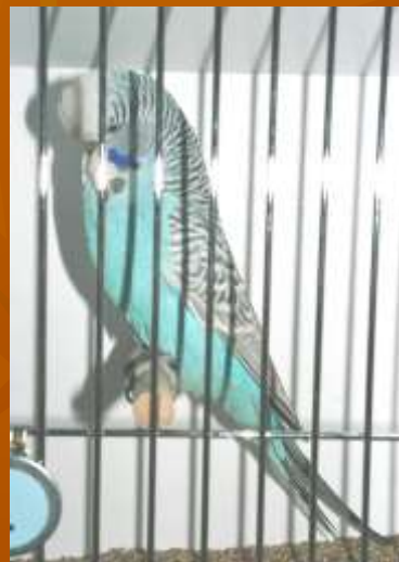
2003 Winner D Ganzer South Qld