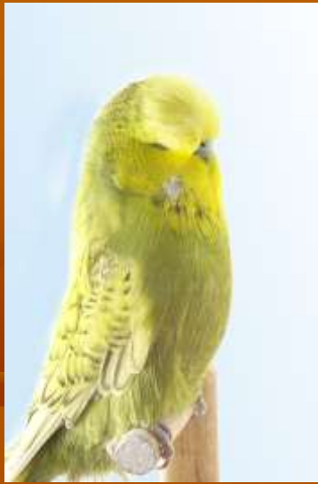
2002 Winner G Armstrong WA