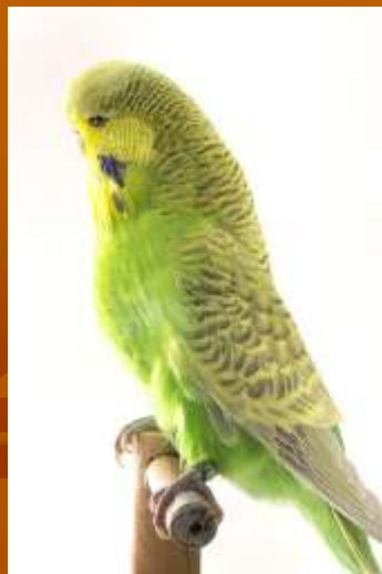
2002 Winner A BROWN VIC