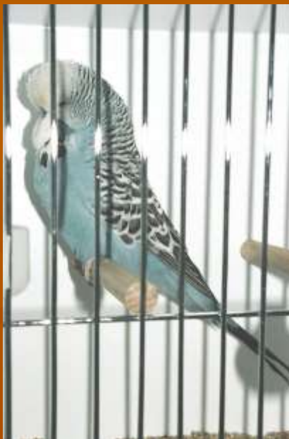
2003 Winner Alan Rowe