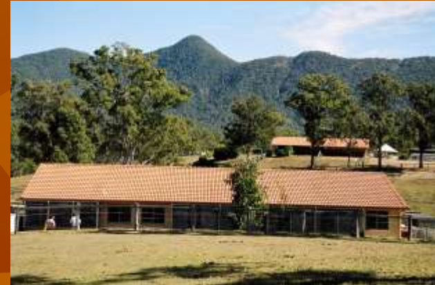
What a great location for an Aviary