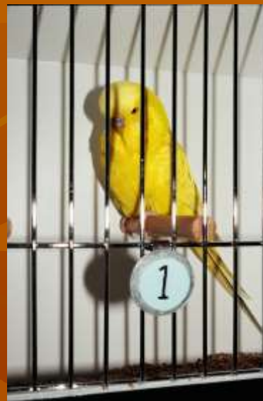
2004 Winner H Wood NSW