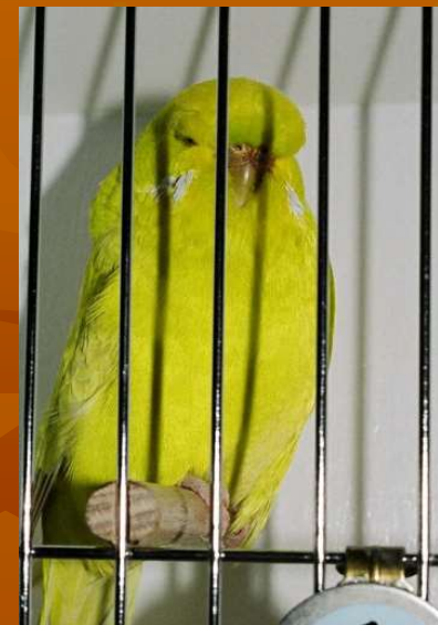
2005 Winner W & T Cusack NSW