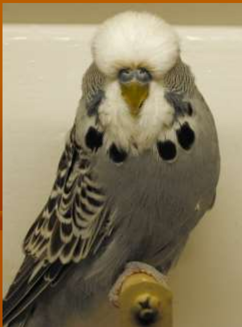
2004 Winner C & B Gearing WA