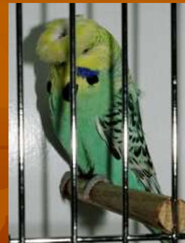
2005 Winner Kakoschke & Rice SA